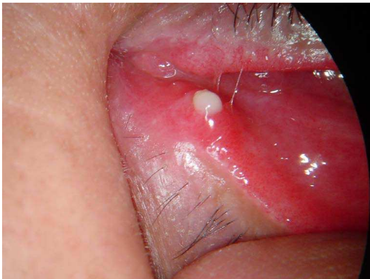
Fig. 10. Patient with chronic trachomatous scarring and canaliculitis and conjunctivitis