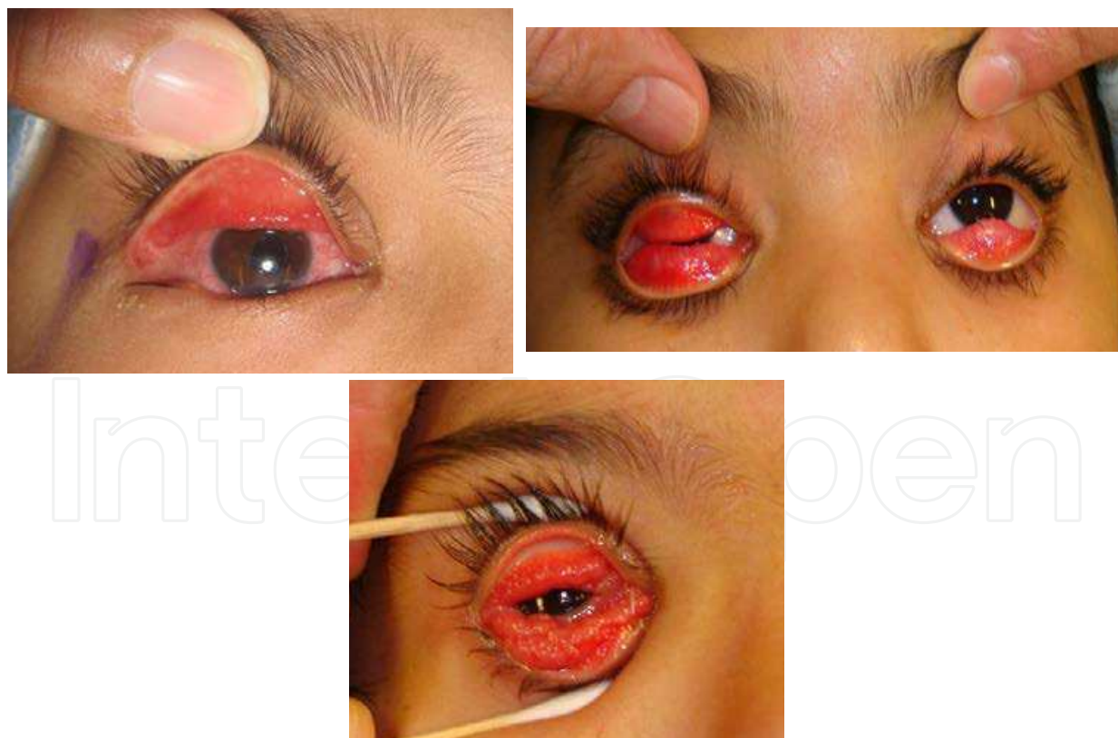
Fig. 1. Right upper eyelid of a child showing follicular reaction due to trachomatous conjunctivitis (upper right). Bilateral trachomatous conjunctivitis in another child with discharge (upper left). Intense follicular reaction in the right eye of a young child with trachomatous conjunctivitis (bottom figure).

The initial response of an eye to infection with C. trachomatis is conjunctivitis involving the palpebral and bulbar conjunctiva. 7,8 In these eyes, the conjunctiva may be inflamed, swollen along with papillary hypertrophy prominent in the palpebral conjunctiva (Figure 1). The initial conjunctival response may be followed by lymphoid follicle formation, most