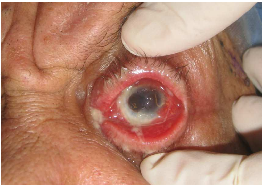
Fig. 7. An older patient having old trachoma and chronic dacryocystitis causing mucupurulent discharge