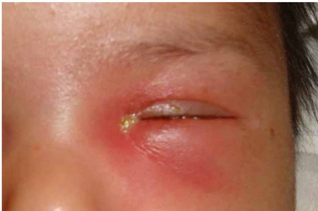
Fig. 8. New born with neonatal conjunctivitis due to Chlamydia

incubation period of 10 to 14 days compared with the much shorter 2 to 3 days incubation for Gonococcal ophthalmia. The conjunctiva of the eye in these patients may be significantly swollen with much mucoid discharge that may be less purulent than that usually seen with overt Gonococcal ophthalmia. The infection is particularly common in pre-mature babies, who are often born to women at particular risk of C. trachomatis infection. 24 Conjunctival swab obtained from the cul-de-sac of these patients stained with C. trachomatis specific fluorescent monoclonal antibody often shows the presence of chlamydial elementary bodies, looking like the "star-spangled sky at night". In neonatal conjunctivitis, the nasopharynx is also commonly infected with C. trachomatis , presumably via drainage from the oto-lacrimonal duct, so it is important to treat the infants with systemic rather than topical antibiotic. If left untreated, up-to 20% of infants may develop neonatal pneumonia. 39