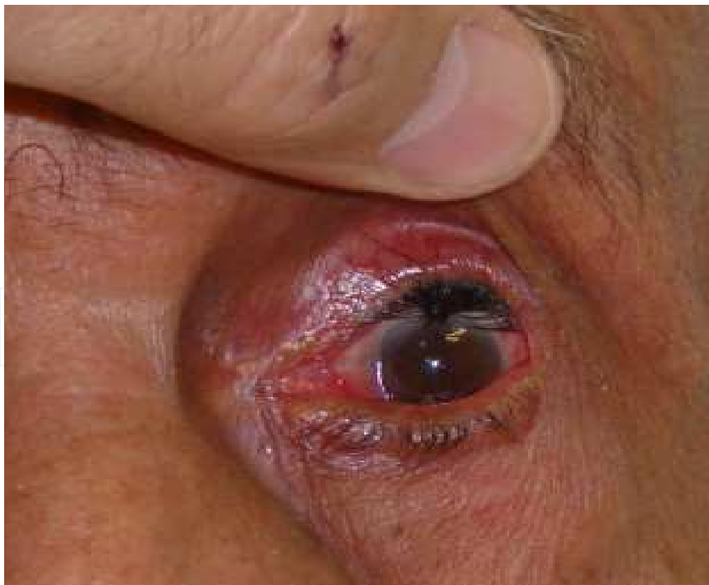
Fig. 9. An elderly patient with old trachomatous scarring and upper eyelid entropion causing chronic conjunctivitis

Eyelid surgery to correct trichiasis is important in people with trichiasis, who are at high-risk for trachomatous visual impairment and blindness. Eyelid surgery to correct entropion and/or trichiasis may prevent blindness in individuals at immediate risk (Figure 9). 48-50 Eyelid rotation limits the progression of corneal scarring. In some cases, it can result in improvement in visual acuity due to restoration of the visual surface and reductions in ocular secretions and blepharospasm. 51 The WHO has produced a training manual on the bilamellar tarsal rotation procedure. This procedure involves a full-thickness incision of the scarred lid and external rotation of the distal margin by using 3 sutures. In regions where access to ophthalmologists is limited, well-trained and well-supported health workers can perform bilamellar tarsal rotation. Results of randomized clinical trials have confirmed the superiority of this method over other techniques. Even after successful surgery, patients remain at risk for recurrence. Therefore, long-term follow-up care and intermittent screening are important after surgery. Recurrence rates vary greatly between surgeons. Evidence supports the adjuvant use of single-dose azithromycin to patients at the time of surgery. Patients experiencing recurrent episodes of chronic dacryocystitis and/or canaliculitis may benefit from surgical intervention (Figures 4,7,10).