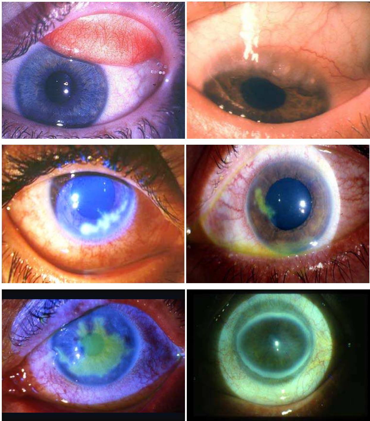
Fig. 1. Images of allergic conjunctivitis in pediatric patients. It is evident the presence of conjunctival hyperemia and oedema.

allergic conjunctivitis as well as the more severe forms as vernal keratoconjunctivitis and atopic keratoconjunctivitis (Leonardi et al. , 2008).