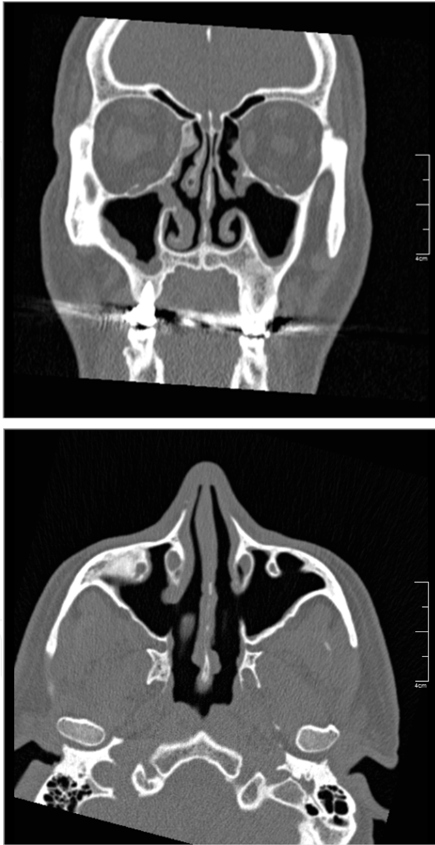
Fig. 2. Coronal and axial CT for patient with RCRS showed osteitis in the maxillary wall.