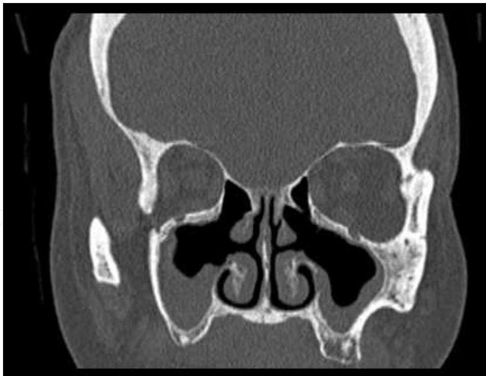
Fig. 1. Coronal CT scan for patient with RCRS, thickened mucosa with patent sinus ostium and Osteitis of the left lateral maxillary wall.

Direct visualization using 0 and 30 degree rigid endoscopy is crucial in this group of patients, to look for any evidence of active infection or obstruction to sinus ostium. The presence of polyps, pus, synechiae, stenosis, middle turbinate lateralization should also be evaluated. Pathological looking mucosa can be biopsied under local anesthesia as office procedure to rule out systemic diseases or tumors.