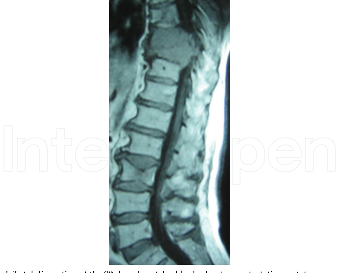
Fig. 4. Total disruption of the 9<sup>th</sup> dorsal vertebral body due to a metastatic prostate carcinoma, with spinal cord compression.

The progression of metastatic bone disease in patients with prostate cancer can lead to debilitating skeletal-related events (SREs) (Oofelein MG, et al., 2002). About 70–80% of patients with metastatic prostate cancer present with or develop bone metastasis (Polascik TJ, 2008), and are at increased risk for skeletal-related events (SREs), which include pathological fractures, spinal cord compression (figure 4), and severe pain requiring radiotherapy or surgery for bone lesions. These SREs result in significant complications that reduce quality of life (Botteman MF, et al., 2010).