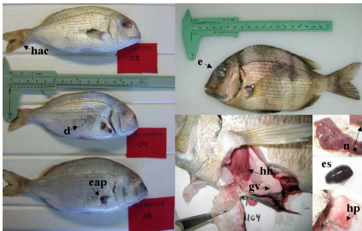
Fig. 1. Main external symptoms and pathological signs in the internal organs observed in affected fish. (hac) haemorrhages in caudal fin; (d) skin desquamation; (eap) fin erosion; (e) exophthalmia; (hh) haemorrhagic liver; (gv) visceral fat accumulation; (n) necrosis; (es) splenomegaly; (hp) petechiae.