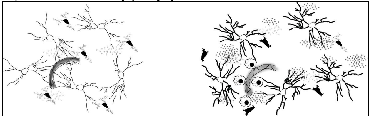
Fig. 2. Schematic of role of astrocytes in pathogenesis. Normal astrocytes (at left) have foot processes ensheathing over 60% of the endothelium and express low levels of GFAP and cytokines / chemokines. In encephalitis, there can a loss of connection to the endothelial cells, increased cytokine / chemokine secretion and altered expression of intermediate filaments, including GFAP and peripherin (right).

of eotaxin (Cardona et al., 2003), reinforcing the brain's immune-privileged status in conjunction with the selective physical properties of the BBB.