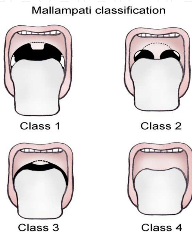
Fig. 4. Mallampati classification of airway management.

procedure with the patient. He will then sign the consent form allowing the endoscopist to perform the procedure and to be given sedating medications (if agreeing to sedation). The anticipated level of sedation should be congruent with the expected level of sedation by the individual as much as possible. The endoscopist will also review the colonoscopy procedure, the benefits, risks and complications to patients who are not receiving sedation. Preparation is the same as for sedation in the event that an emergency arises or the patient requests medication during the procedure.