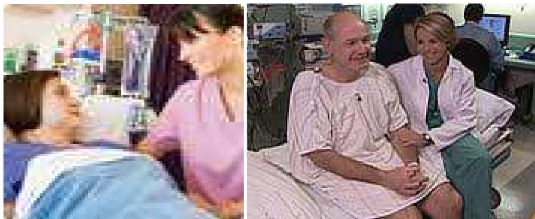
Fig. 3. Confidence and satisfaction in colonoscopic procedures