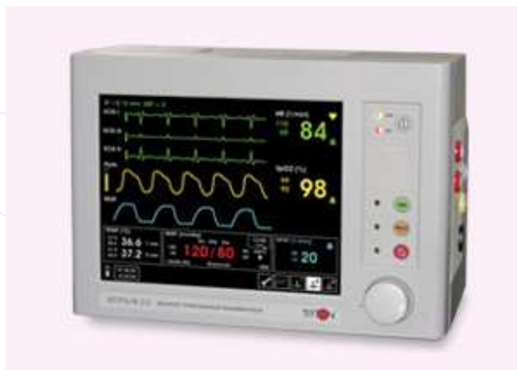
Fig. 5. Sample of monitoring equipment used

During the procedure, the patient is hooked up to a monitor that measures and displays the heart rate, blood pressure, and oxygen saturation (Figure 5) and in some cases, carbon dioxide levels (capnography). Some have also used transcutaneous carbon dioxide measurement or bispectral index monitoring (BIS). The latter is a quantitative assessment of cortical activity that has been used to monitor sedation and adjust sedation levels (Kissin, I., 2000). These are monitored by a licensed personnel (usually the person providing the sedation) every 3-5 minutes during the procedure and with each incremental dose of the sedative. Monitoring may detect changes in the individual's blood pressure, heart rate, cardiac electrical activity, ventilatory, and neurologic status that might signal a clinically significant compromise of the patient's health status or that the patient has progressed to a deeper level of sedation than originally intended. Oxygen is usually given as an adjunct via a nasal cannula or mask as all of the sedation agents depress the respiratory system. The ASA guidelines recommend that patients receiving sedation medications receive continuous electrocardiogram (ECG) monitoring, especially if they have significant cardiovascular disease or arrhythmias. 20 Parameters outlined in the Modified Aldrete scoring system, which includes the above mentioned items plus activity and consciousness are also monitored and recorded.