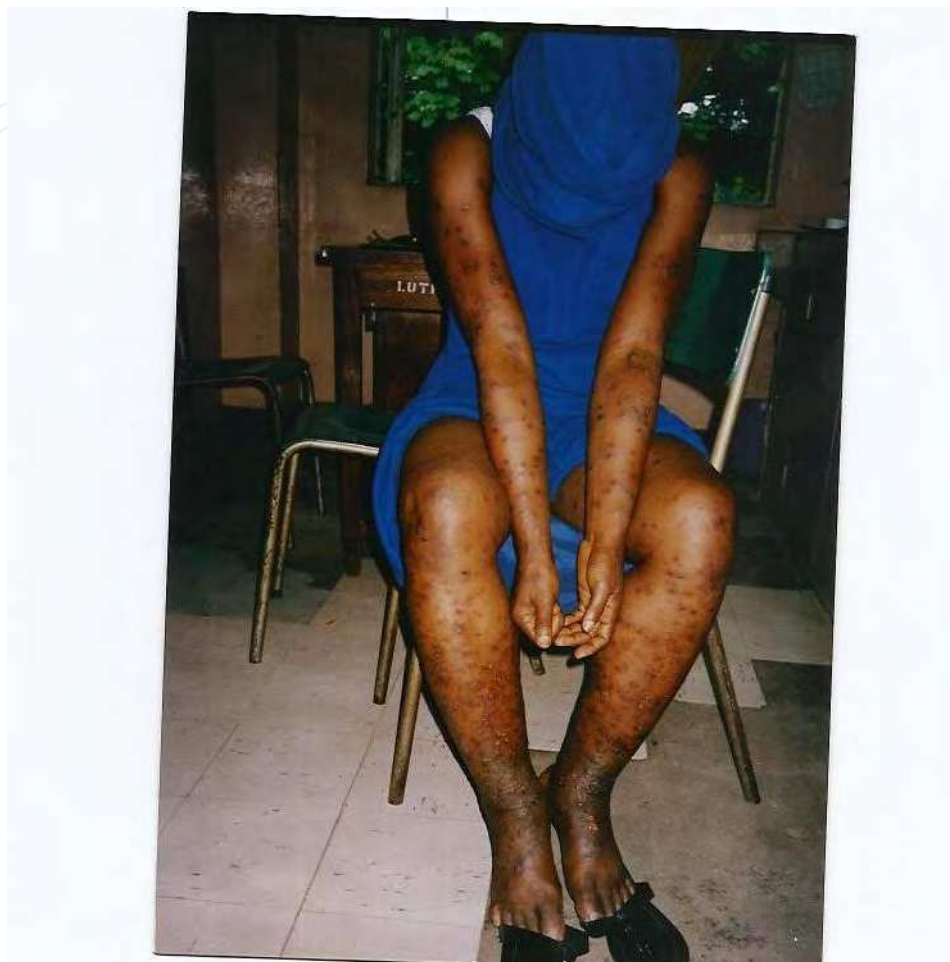
Fig. 4. Pruritic papular of HIV infection

Treatment with antihistamines, phototherapy and photochemotherapy may be used but of limited success. Patient education as to the cause of the illness is important.