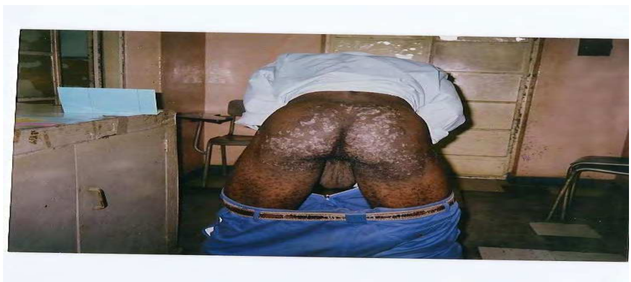
Fig. 3. Extensive tinea cruris and corporis