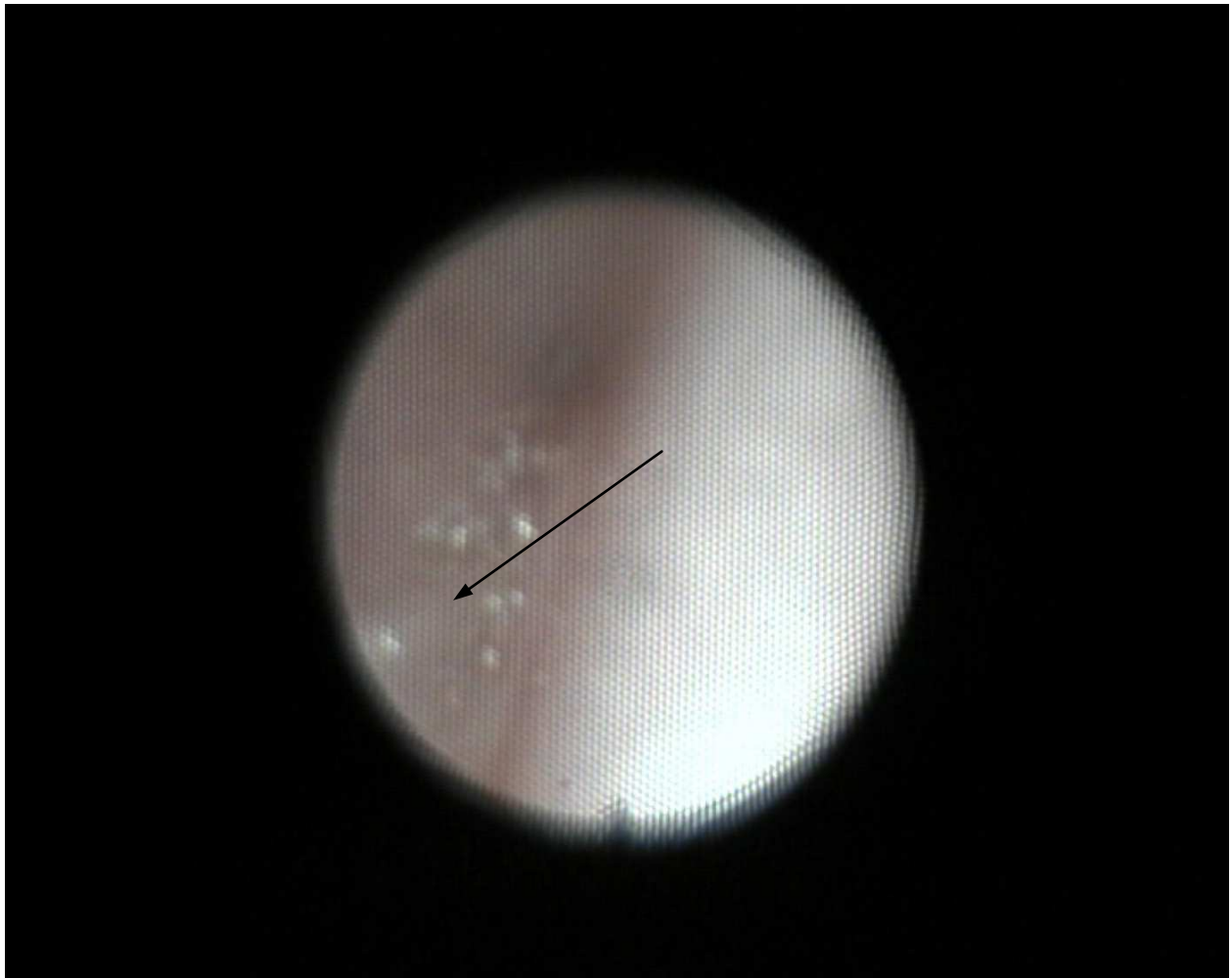
Fig. 3. Placement of embryo(s) under hysteroscopic guidance; arrow points to the tip of the catheter; catheter entry at 8 o'clock position.

“feel” for the scope. The transfer catheter (Precision Reproduction, LLC, LA, CA USA) is polycarbonate based with a tapered tip (to 500 \mu\text{m} ), beveled to 60°.