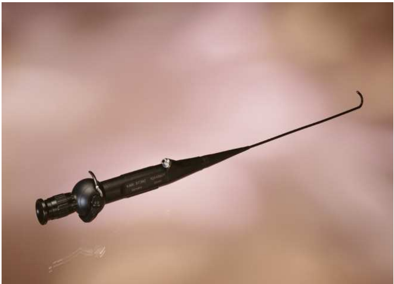
Fig. 1. Mini flexible hysteroscope (Storz®, LA, CA USA)

A transvaginal ultrasound of the uterus is performed and the direction and thickness of the endometrial lining is ascertained. With patient in dorsolithotomy position, a bivalved speculum is placed in the vagina and the cervix exposed. Vagina and cervix are washed with modified HAM's solution. Subsequently, 10 cc of 1% xylocaine is injected bilaterally in the utero-sacral nerve endings.