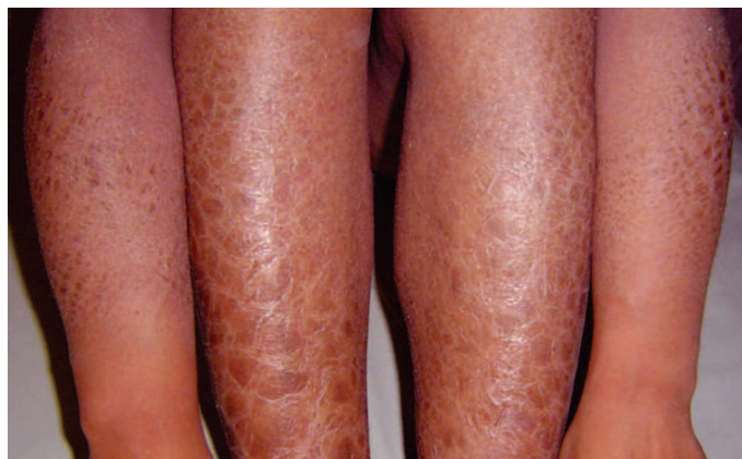
Fig. 1. The flushing, swelling and dry scaling of skin were seen throughout the whole body in a 27-year-old Chinese female patient with ichthyosiform erythrodermia Sarcoidosis. The Ichthyosiform skin lesions especially seen in upper and lower extremities.