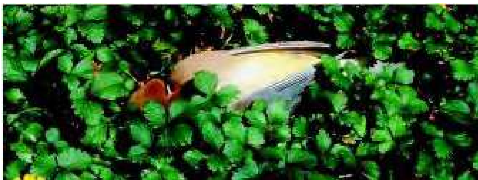
A bird that died as a result of pesticide use.

The herbicide parquet , when sprayed onto bird eggs, causes growth abnormalities in embryos and reduces the number of chicks that hatch successfully, but most herbicides do not directly cause much harm to birds. Herbicides may endanger bird populations by reducing their habitat. (U.S. Environmental Protection Agency, 2007).