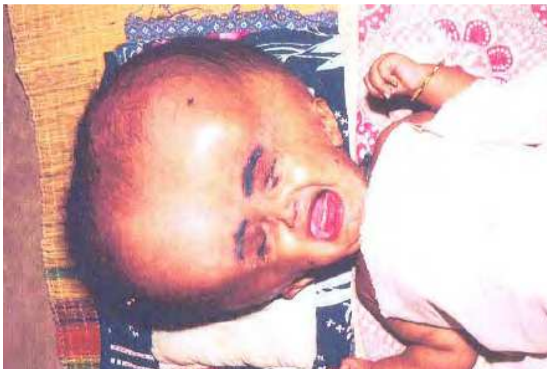
Photos of some victims of endosulphan tragedy