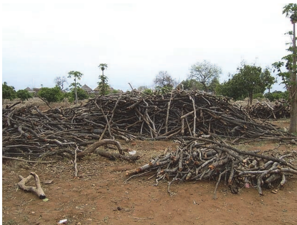
Fig. 4. Illegally collected fuelwood (mostly Colophospermum mopane ) confiscated by Magona Traditional Authority in August 2004.

Firey's predictions may indeed be materializing in South Africa. Political transformation processes have led in many cases to de facto open access systems with new forms of opportunism, manifested by perverse incentives for unsustainable resource extraction, especially by 'gain-seeking' outsiders (Figure 4). These are exacerbated by low capacities in the provincial government structures and fueled by the stripping of powers of legitimate TAs (Anthony et al., 2010). According to a KNP internal report, increasing rates and magnitude of inter alia deforestation has been observed in areas adjacent to KNP claiming that 'trucks transporting newly cut poles and wood are often observed along the roads in adjacent areas'. In its summary, this report emphasized that 'the rate at which the destruction and degeneration is taking place will render the area useless for future community-based conservation projects.'