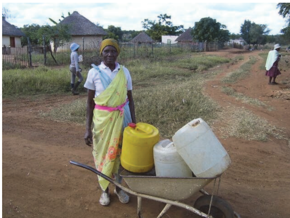
Fig. 3. Tsonga woman on route to collect drinking water from community tap. Reproduced with permission from Anthony (2006)

Opinions expressed on nature conservation, i.e. protecting trees and wild animals, lag far below more immediate development needs such as employment, health, education, and improving infrastructure. Employment needs were apparent as we noted male absence in the study area, which is likely attributable to outmigration (or cyclic migration) to larger urban centers or mines where employment opportunities are greater (Bryceson, 1999). Male absence in rural areas can create labor vacuums, especially in cases where domestic responsibilities are sharply divided amongst household members, and may disproportionately increase pressures on households with only women and children. In this research about one in eight households was comprised only of women and children. This constraint is exacerbated by time required for women and children carrying out domestic chores, including almost 20 hours per week for collecting fuelwood and drinking water alone in the study area (Figure 3) (Anthony, 2006). With water scarcity perceived to be widespread in the study area, and fuelwood becoming scarcer in some areas north of the