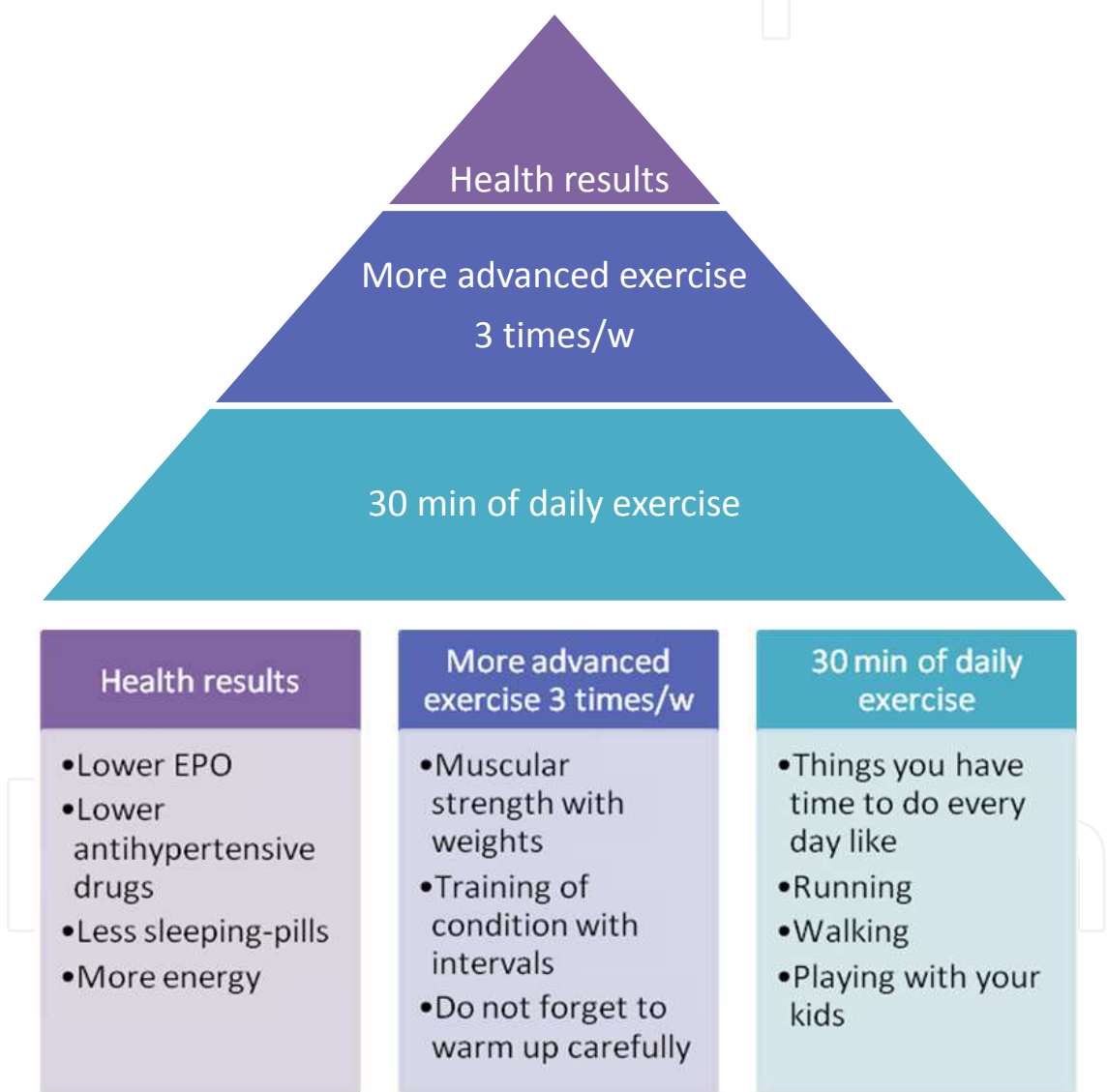
Fig. 1. The amount of training and training effects in CKD patients in a schematic form