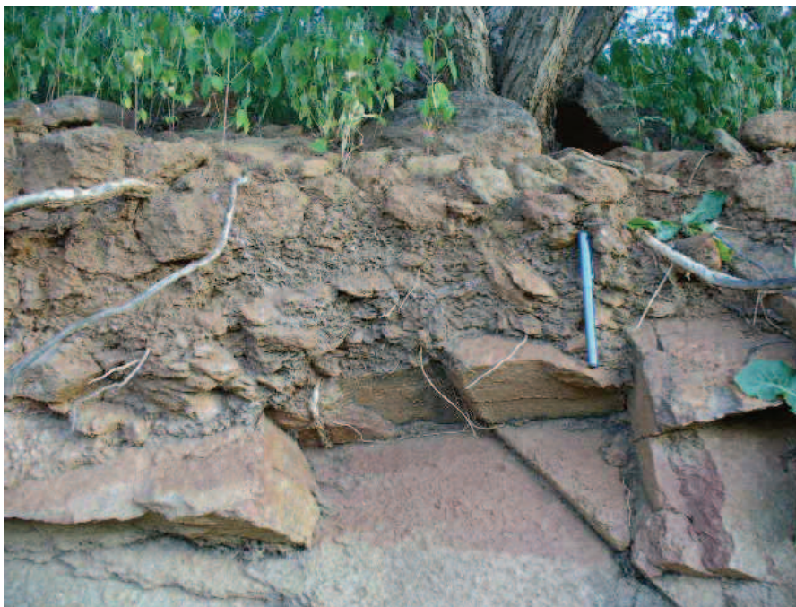
Fig. 2. Windhoek soil profile measuring 20 cm from the Northern Industrial area. The bottom of the pen shows the bedrock-soil profile contact. Note the immaturity of the soil horizon.

Once the pesticides have found their way to the water table, cleaning them is difficult. The pesticides will then be ingested by both livestock and humans through drinking water. In Namibia, livestock farming forms the largest source of export oriented agricultural activity (Table 1). In arid areas, which is mainly in the freehold zones of the country, groundwater is the only source of water for livestock. This is especially the case in the southern part of the country, where cropping is not practiced.