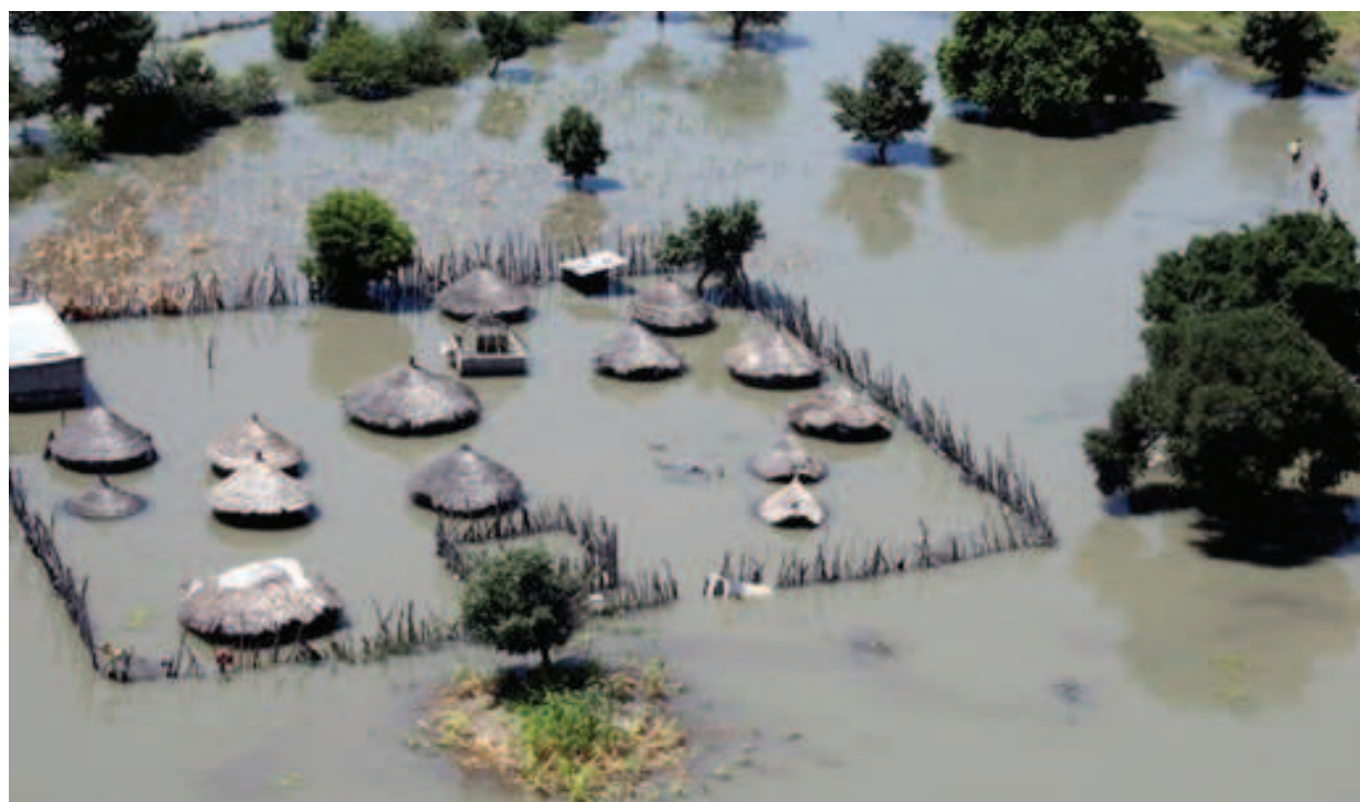
Fig. 4. Flooding in the Oshakati area in 2009, some 800 km north of Windhoek.

In Windhoek pesticides are applied for weed removal in paved areas such as airfields car parks, road pavements, and railway lines and sports facilities where grass is kempt for recreation purposes. These sources of pesticides pose serious problems, given the fact that the Windhoek aquifer is currently used as a major storage facility of fresh water.