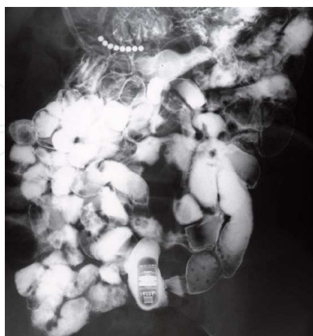
Fig. 2. Capsule retention.

The most significant complication in the CE examination is capsule retention (Fig.2). Capsule retention is defined as having a capsule endoscope remain in the digestive tract for a minimum of 2 weeks (Cave, 2005). A preceding normal small-bowel series does not preclude subsequent CE retention. The reported capsule retention rate in a study of 900 adult patients was approximately 0.7% (Barkin, 2002). It should be noted that there are potential risks of retention in CD, especially known CD. A previous study in adults (Cheifetz, 2006) revealed that CD is an potential risk of having the retention which is caused by unsuspected strictures, and retention was occurred in 13% (5 of 38) of patients with known CD , whereas in 1.6% (1 of 64) with suspected CD. When we reviewed previous CE studies of pediatric patients, which included at least 10 CE examinations for each patient, and found that 13 capsules had been retained in a total of 345 CE examinations giving an average frequency of capsule retention of 3.7% (range, 0–20%) (Table 4).