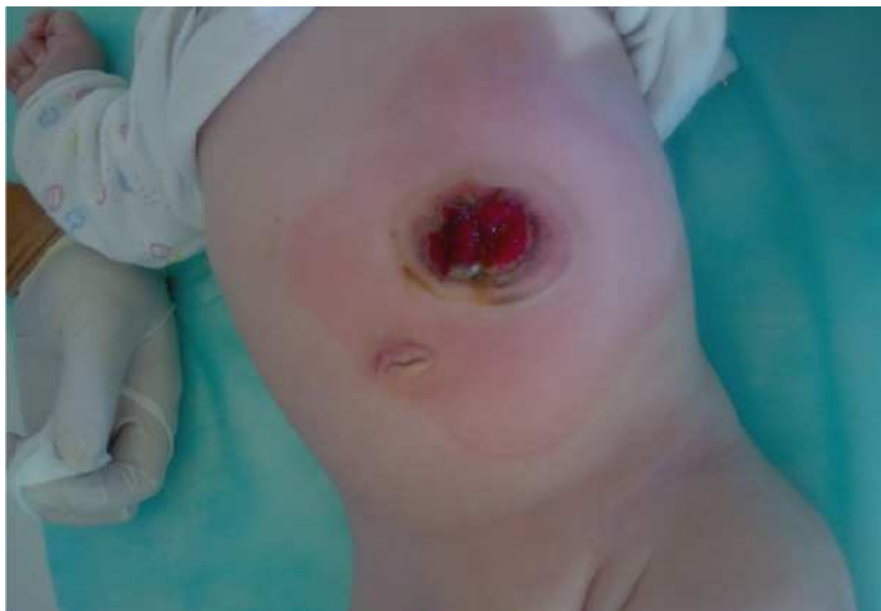
Fig. 4. Single port leveling colostomy after serial biopsies