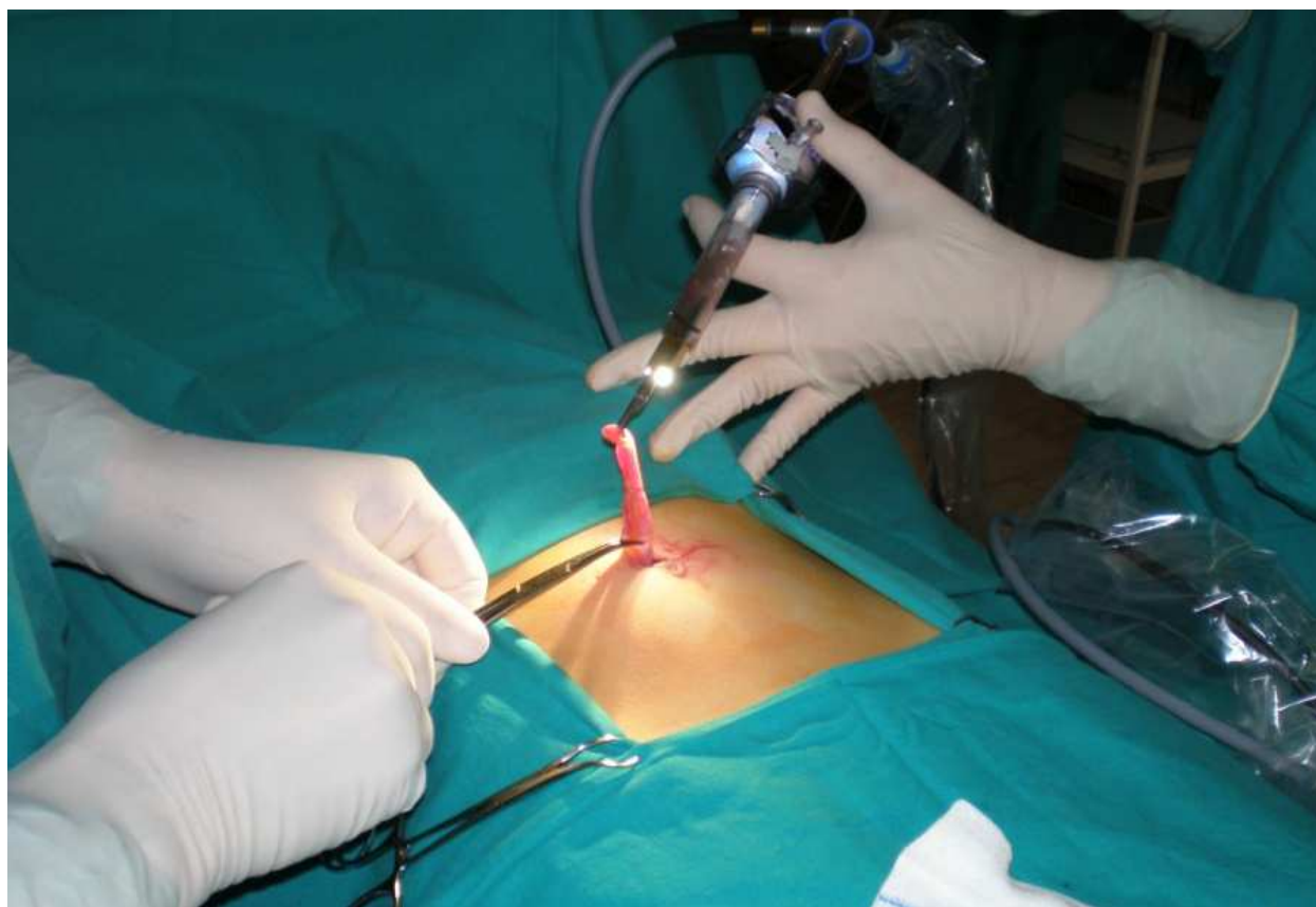
Fig. 2. Port, scope and instrument should be brought out of abdomen together with appendix