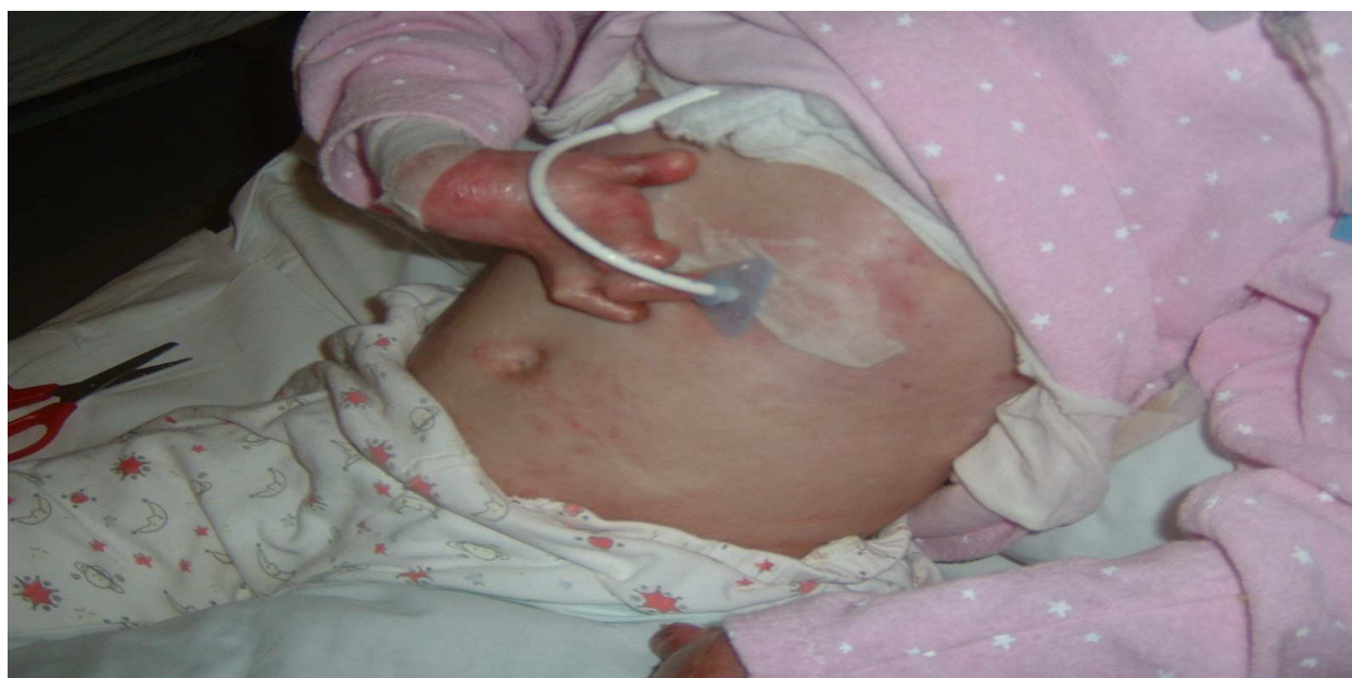
Fig. 3. Laparoscopic gastrostomy in epidermolysis bullosa

For those children whose esophagus is not passable for flexible endoscopy, e.g. refracter strictures, epidermolysis bullosa, (Figure 3) etc, endoscopic guidance by transstomach illumination is not possible. Then, gastrostomy made by an operative laparoscope placed trough the umbilical port could be one of the options. The stomach and abdominal wall can be visualized directly thus limiting the chance of inadvertent injuries. Stomach is fixed by a fine grasper and approximated to the abdominal wall. Two percutaneous sutures are placed and PEG cannula can be inserted into the stomach as in endoscopic PEG placement, but now