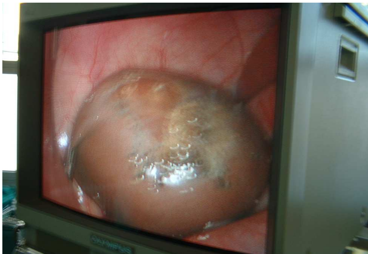
Fig. 5. Preserved integrity of the cyst after laparoscopic mobilization

If the cyst wall is attached to the parietal peritoneum, dissection is necessary. By pushing cyst forward, loose adhesions are exposed. Dissection of adhesions can be done by scissors' tip (curved tip scissors) as close as possible to the peritoneal side in order to preserve the integrity of cyst wall until the whole cyst is completely freed and mobile (Figure 5).