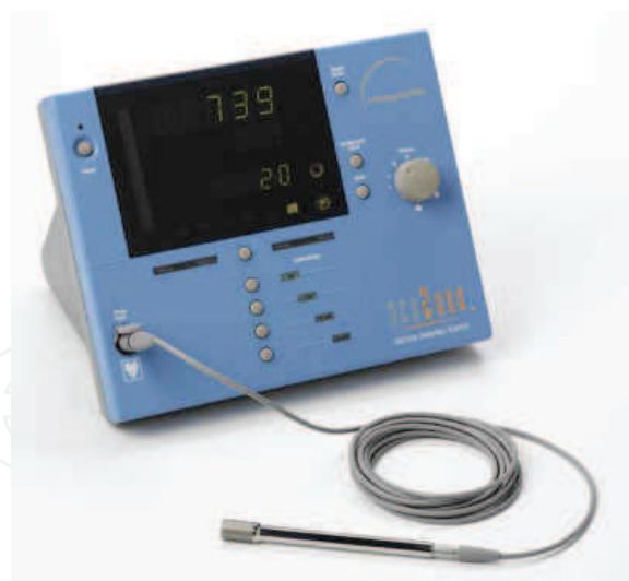
Fig. 2. Gamma probe used to locate sentinel lymph node

Significant controversy surrounds the use of sentinel lymph node biopsy in thin, early melanomas. There are a number of reasons for this. Firstly, patients with a low-risk of nodal metastases are exposed to the toxicity of a potentially unnecessary procedure. Secondly, the routine use of sentinel lymph node biopsy is expensive: global application of sentinel lymph node biopsy in all patients is estimated to cost between $700,000 and $1,000,000 for every sentinel node metastasis detected (Agnses et al., 2003).