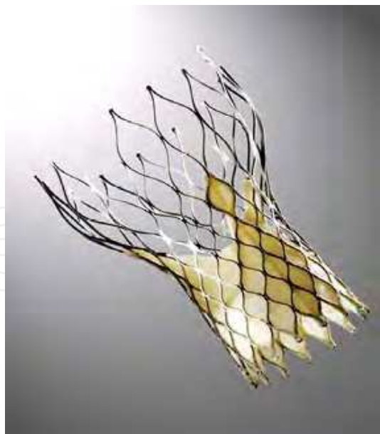
The Core Valve

The new Edwards Lifescience device, the Sapien-XT valve, can be delivered by an arterial or venous access site (anterograde or retrograde technique) as well as by a transapical approach; it has the CE mark since 2007 and has the FDA investigational device exemption for the PARTNER US trial. Like the CoreValve system, more than 10.000 devices have been implanted all around the world with promising initial results. It is constructed with a bovine pericardium valve sewed to a balloon expandable chromium-cobalt stent to be anchored to the calcified native aortic annulus. Three sizes are commercialized: 23mm (for aortic annulus between 18 and 21mm), 26mm (for aortic annulus between 21 and 25mm) and the recently added 29mm size for annulus over 25mm. The femoral sheath is 18F for the smaller size and 19F for the 26, and the transapical sheath is 22F for the smaller, 24F for the 26mm size and 26F for the 29mm. No femoral system has been designed yet for the 29mm valve.