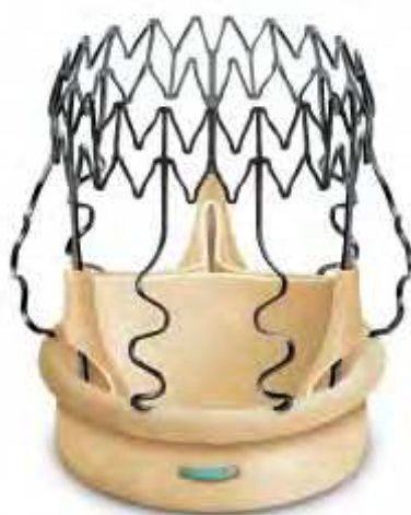
Perceval Sorin Valve