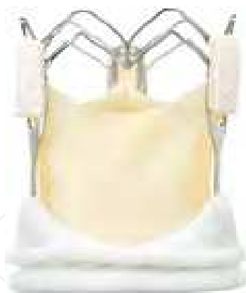
Enable 3F Valve