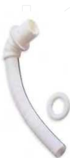
Aorto-apical conduit Medtronic Hancock

Surgical aortic valve replacement by median thoracotomy under cardiopulmonary bypass is, as mentioned above, the standard therapy for severe aortic stenosis that has proven superiority to conservative pharmacological therapy. Many times, however, this treatment cannot be performed because of different technical, anatomic or clinical problems that the patient may present, as it could be porcelain aorta or tiny aortic annulus. Aortic valve conduits, also known as apicoaortic conduits, are a sort of devices designed in the sixties to give an alternative in these situations. Apicoaortic conduits connect the left ventricle apex with the descending thoracic aorta, relieving the intraventricular pressure by allowing the blood flow to find a way out of the heart without fighting against the aortic valve resistance. Because the operation was technically difficult, it had fallen into disuse, but, with the introduction of technically easier and less invasive procedures performed by minithoracotomy, this alternative offers clear advantages over standard valve replacement (avoidance of sternotomy, cardiopulmonary bypass, cardioplegic cardiac arrest, native valve debridement, conduction system injury, aortic cannulation, and aortic cross-clamping) and arises as another option in addition to transcatheter aortic valve implantation as alternative therapy for high risk patients. This technique offers the possibility to choose from a big variety of valve models and sizes, it