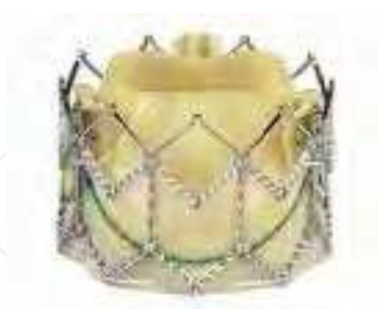
The Edwards Sapien XT valve

The new Edwards Lifescience device, the Sapien-XT valve, can be delivered by an arterial or venous access site (anterograde or retrograde technique) as well as by a transapical approach; it has the CE mark since 2007 and has the FDA investigational device exemption for the PARTNER US trial. Like the CoreValve system, more than 10.000 devices have been implanted all around the world with promising initial results. It is constructed with a bovine pericardium valve sewed to a balloon expandable chromium-cobalt stent to be anchored to the calcified native aortic annulus. Three sizes are commercialized: 23mm (for aortic annulus between 18 and 21mm), 26mm (for aortic annulus between 21 and 25mm) and the recently added 29mm size for annulus over 25mm. The femoral sheath is 18F for the smaller size and 19F for the 26, and the transapical sheath is 22F for the smaller, 24F for the 26mm size and 26F for the 29mm. No femoral system has been designed yet for the 29mm valve.