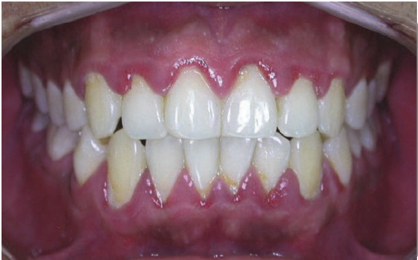
Fig. 2. Severe gingival changes in a woman with heavy plaque deposits during the second trimester (School of Dentistry, Universidad El Bosque, 2010. Used for academic resources)