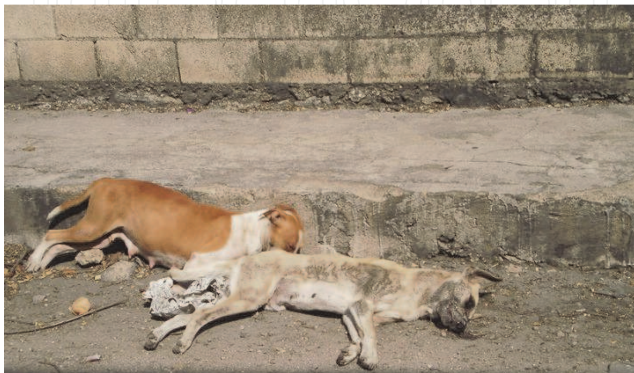
Fig. 5. Stray dogs poisoned during a municipal campaign

risk factors of disease, preventive disease and maximizing production. Production goals in companion animals would be an acceptable level of welfare and considerations of the incidence and prevalence of clinical and behavioral disease (Hurley, 2004). The implement of the shelter medicine in two Italian shelters (where laws do not currently allow euthanasia as a suitable method to control shelter population or used for scientific purposes) during three years and without admission of new dogs “closed system” resulted in improved dog health and welfare, as indicated by the significant reduction in both the prevalence and incidence of major pathologies during the next two years (Dalla Villa et al., 2008).