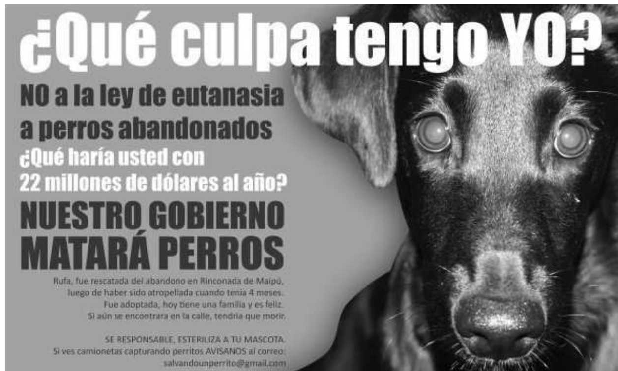
Fig. 6. Signal of protest against the decision of killing dogs in the city of Neuquen, Argentina. From the text “Why is my fault? No to the euthanasia law against stray dogs. What would you do with 22 millions of dollars a year? Our government will kill dogs” (available at: www.taringa.net/posts/solidaridad/6490679/Firma-el-petitorio-en-repudio-a-la-matanza-en-Neuquen_.html )