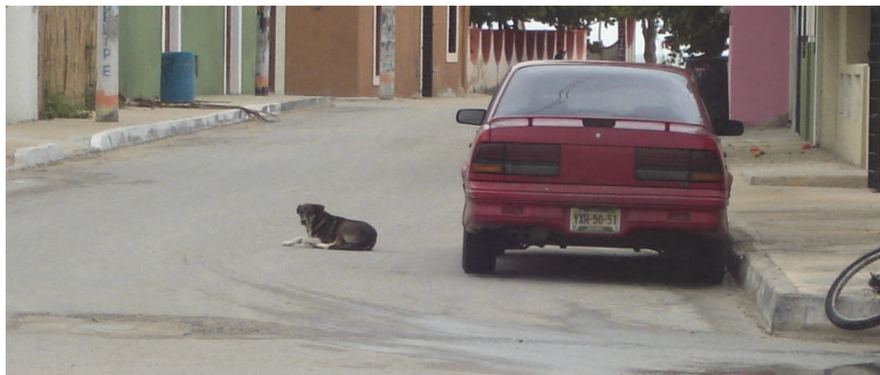
Fig. 1. An owned free roaming dog in a city

the population of owned dogs. Of the dogs that died in this model (6.2 million), over a third (2.4 million) died in shelters (Patronek & Rowan, 1995).