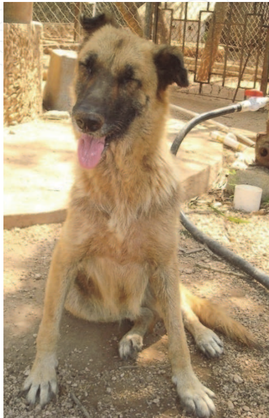
Fig. 4. A dog from a shelter considered for euthanasia

of public on animal welfare issues and subsidizing spay neuter programs, the number of unwanted dogs have decreased but after almost a decade, no changes in the euthanasia rate of dogs (3.7/1000 residents/year) have been observed indicating that the shelters dynamics of dogs appeared to reached an equilibrium with respect to euthanasia (Morris et al., 2011). A model suggests that the balance between supply and demand for dogs can be achieved such that euthanasia is never required (Frank, 2004).