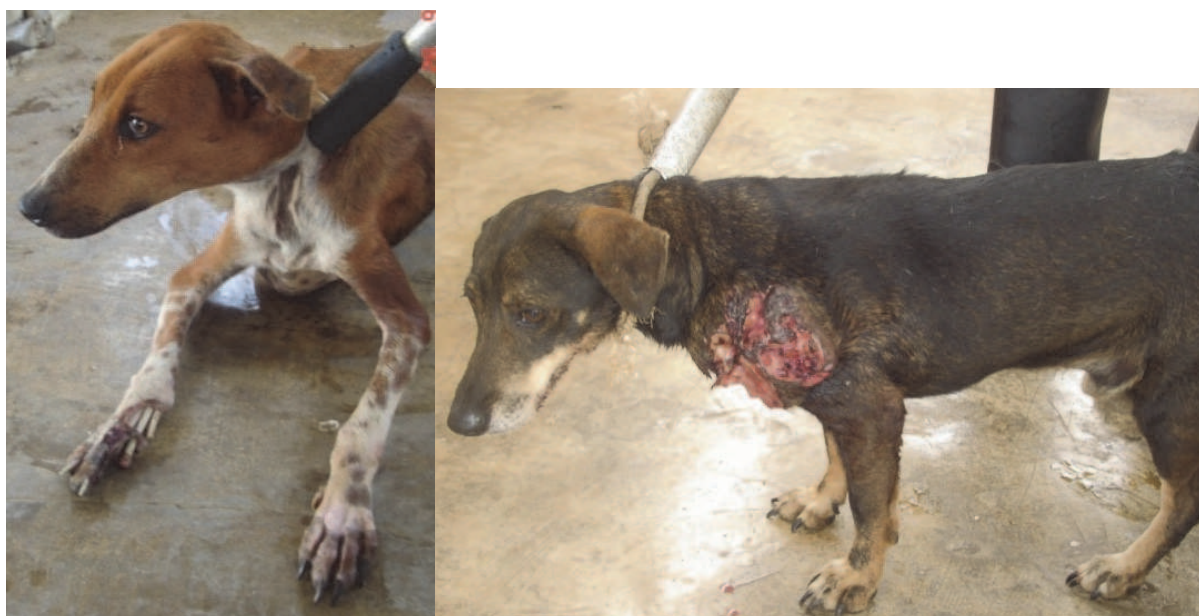
Fig. 3. Stray dogs from a dog pound apt for euthanasia

should be focus on preventing these problems by public education including the supervision of breeding, management of behavioral problems and promoting the culture of adoption. In Barcelona Spain, with the formulation of a city Plan for Pet Animals, the activities were redirected, concentrating on services within the city limits and stimulating adoption. Participation of both professional and humane organizations was sought, premises were renovated, responsible ownership of animals was promoted, controlled urban colonies of cats were established, and adoptions become the cornerstone of policy, centering the activity of the pounds toward its clients. Changes in the dog pound's activity since 1998 reflects a clear decrease in the number of animals retained, as well as in the proportion subjected to euthanasia (from 83.4% of euthanasias of animals entered in 1993 to 47.2% in 2001). This decrease may reflect an improvement in the problem of stray animals. Besides, these developments have also resulted in a positive change in the relationship with the media and animal welfare organizations (Peracho et al., 2003).