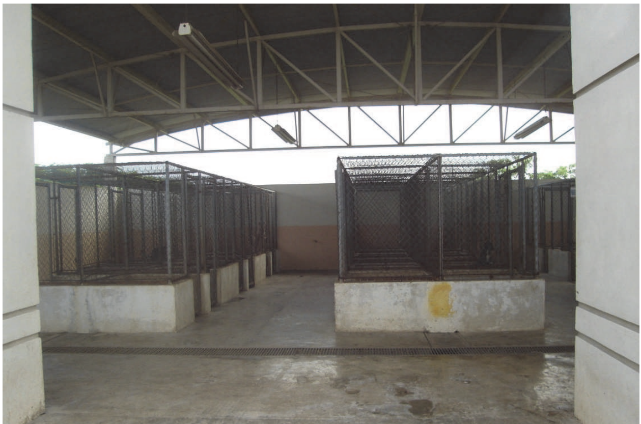
Fig. 2. A municipal dog pound building

An example of dog pound facilities is shown in Figure 2. Dog are protected for 3-10 days to give them the opportunity to be re-homed to their original owners or being adopted. However in dog pound, very few dogs are claimed and the adoption rate is very low or practically non-existing. Under these situation an overflow of dogs rapidly occurs and the quickest way to obtain space is by eliminate them by “strategic euthanasia”. Since practically all dogs are euthanized, no moral conflicts arise by selecting candidates.