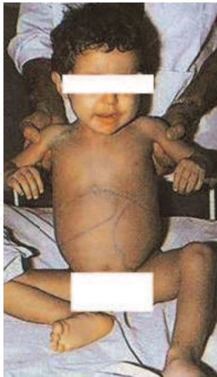
Fig. 3. Classical clinical form of visceral leishmaniasis characterized by hepatosplenomegaly.