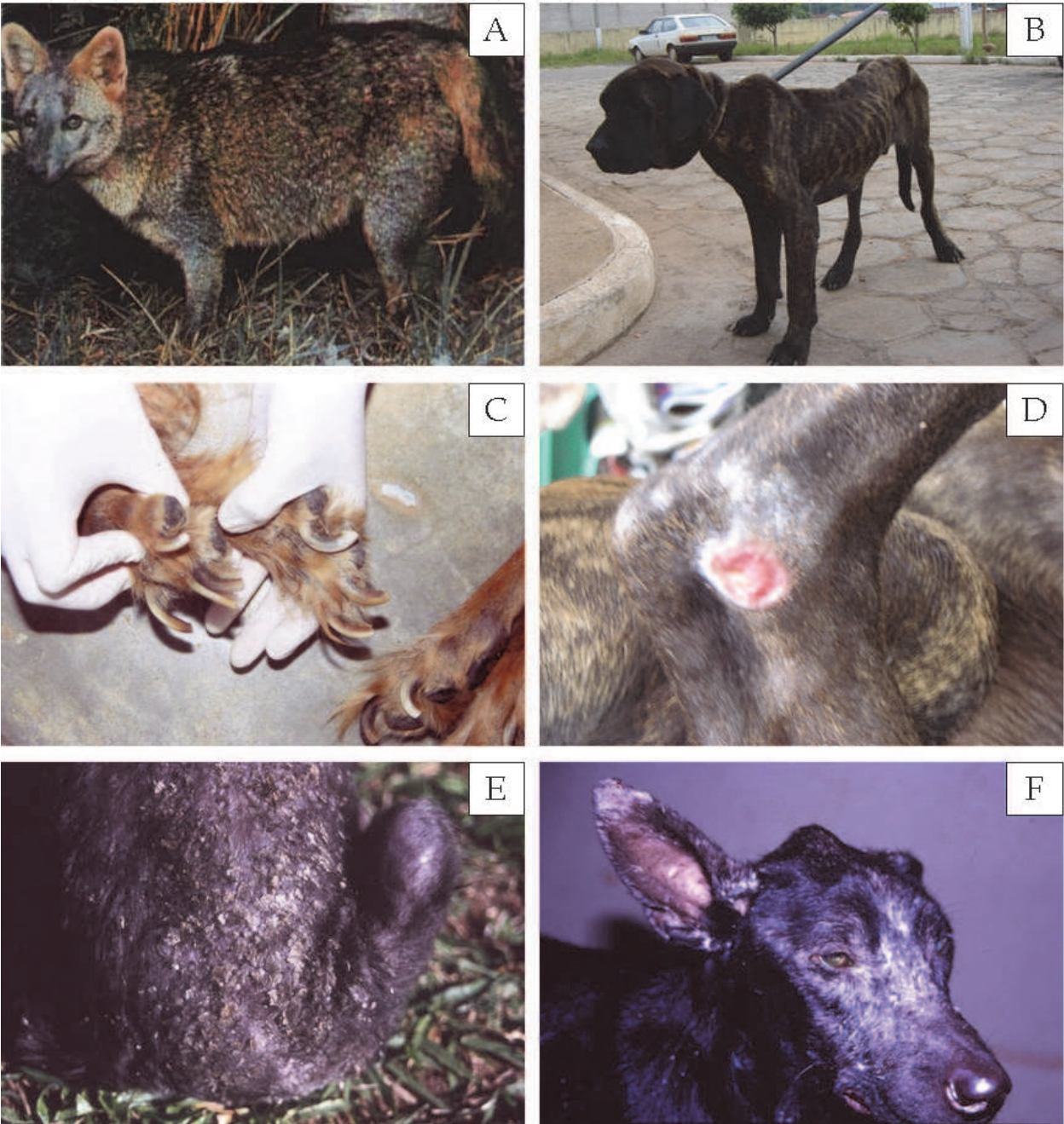
Fig. 4. Leishmania (Leishmania) chagasi wild reservoir (A) and domestic reservoir showing typical clinical features of the disease such as: weight loss (B), onychogryphosis (C), skin lesions: ulcer (D), hyperkeratosis (E) and alopecia (F).

Visceral leishmaniasis is currently emerging and reemerging diseases, both in rural areas as in urban areas. The World Health Organization estimates a global annual incidence of 500 thousand cases. Although the VL is known even today as a disease typically rural, several urban epidemic outbreaks have been reported, due to the favorable epidemiological conditions, mainly in function of the expansion of slums with high population density that have poor sanitary conditions where individuals and infected dogs from endemic areas are your choice of housing in major cities.