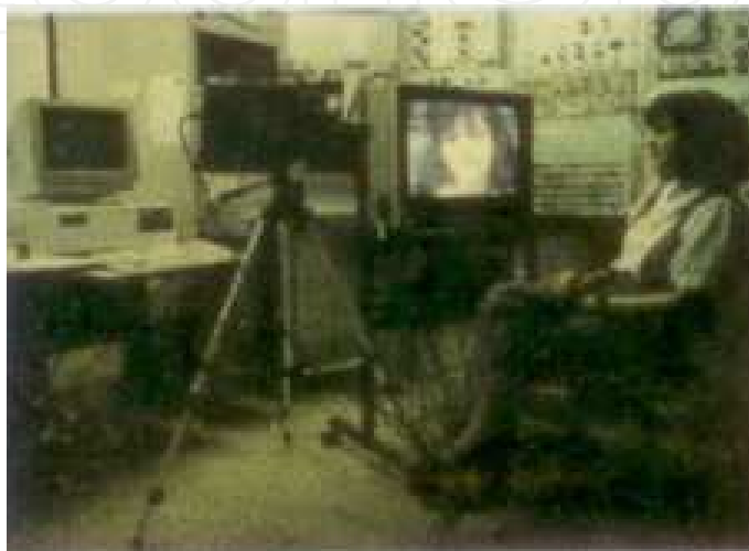
Fig. 4. Experimental Model: Simulated Public Speaking Test

One important example of such procedures is described in the study by McNair and colleagues (1982), who developed a clinical-experimental model of anxiety named Simulated Public Speaking Test (SPST), later modified by Guimarães, Zuardi, and Graeff (1987). The test, initially used to measure the anxiolytic effects of diazepam, consists of asking the subject to prepare a speech and present it in front of a video camera that records his performance (see Figure 4).