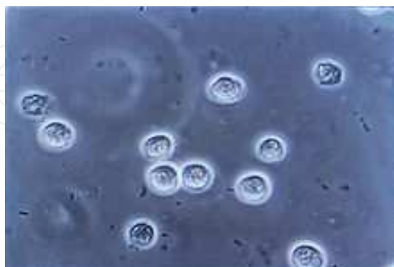
Fig. 1. Multiple bacilli (rod-shaped bacteria have shown as black and bean-shaped) shown between white cells at urinary microscopy. This is called bacteriuria and pyuria, respectively. These changes are indicative of a UTI. See [1a,b]

for the presence of red blood cells, white blood cells, and bacteria, may be useful.[1a,b] Urine culture shows a quantitative count of greater than or equal to 10^3 colony-forming units (CFU) per mL of a typical urinary tract organism along with antibiotic sensitivity is useful to select appropriate antibiotic. [1a,b] On the whole, diagnosis is based on symptoms and urine culture.[1c-d]