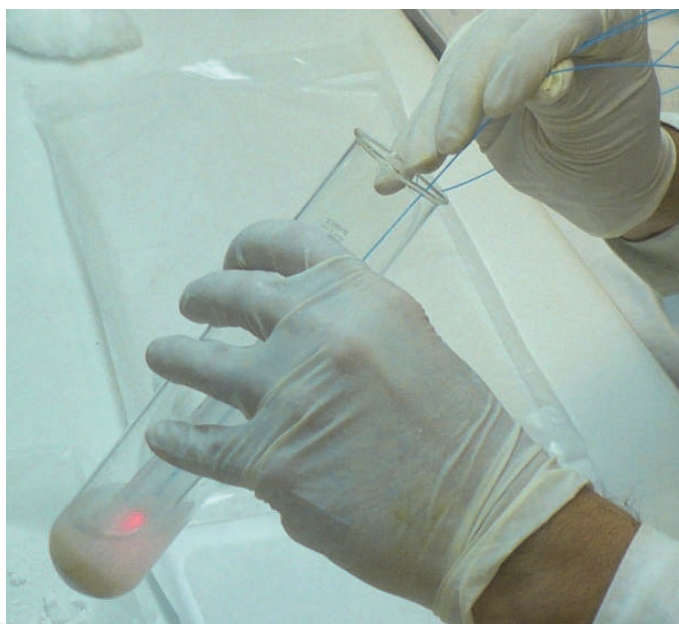
Fig. 1. Photograph of the special lucite test tube with copper mesh bottom (not seen) placed inside a standard glass laboratory test tube during in vitro fragmentation of an artificial infected kidney stone with a laser lithotripter.

inactivation obtained with the other lithotripters at their low energy settings. Increasing the energy resulted in higher bacteria inactivation for the laser, pneumatic and ultrasonic lithotripter. The laser lithotripter produced the lowest bacteria inactivation. Inactivation increased as the energy setting of the laser, pneumatic and ultrasonic lithotripter was changed from low to high. No bacteria inactivation was observed using the pneumatic lithotripter in an E. coli suspension alone. No viable bacteria could be observed after using the laser, the electrohydraulic and the ultrasonic lithotripter in the infected suspension (without stone). Maximum protein release occurred at low energy with the electrohydraulic lithotripter and protein was denaturated by this lithotripter at the high energy setting. No difference was observed between the amount of protein released with the laser, the pneumatic, and the ultrasonic lithotripters at both energy levels. The four lithotripters inactivated more than 99 % of the initial amount of bacteria; however, this antibacterial effect does not necessarily indicate that lithotripters sterilize stone fragments. The presence of free endotoxins liberated from bacteria after lithotripsy may increase the risk of sepsis. These findings could explain local and systemic inflammation response by the immune system of some patients developing in SIRS and sepsis (Gutiérrez et al., 2008).