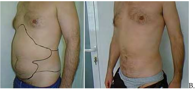
Fig. 6. A. Before, B. Result after 4 months after abdomen and flanks UAL. Loss of fat all around the body - visible loss of volume in the upper arm.