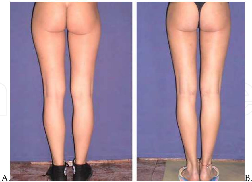
Fig. 3. A. Before, B. After UAL of lower buttocks, outer thighs, inner thighs and inner knees. Result of straitening and legs elongation of a skinny model. Important volume reduction where needed, higher knee position for crus elongation along with smooth results and no surface irregularities.