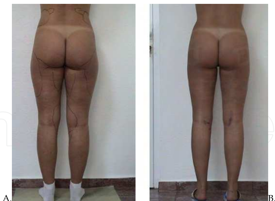
Fig. 1. A. Before, B. Result on day one after UAL of flanks, lower buttocks, outer and inner thighs, inner knees. Good effect of crus and leg elongation. Great loss of fat amount and minimal bruising.