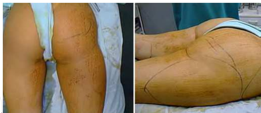
Fig. 4. A. and B. Left buttock reduced using UAL. Right buttock still not treated. Effect of buttock's lift on the left side in different patients using UAL. Visible lift of 3-5 cm of the infragluteal sulcus.