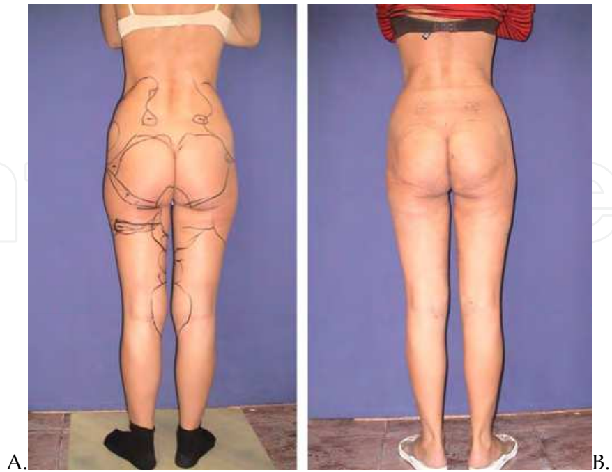
Fig. 2. A. Before, B. Day one after UAL of flanks, lower buttocks, outer thighs, inner thighs and inner knees and buttock lift by Serdev suture technique. Surgical markings from the previous day are still visible. Note the relative elongation of the crus and legs. Buttocks look smaller, rounded and at a higher position due to body proportions changes.