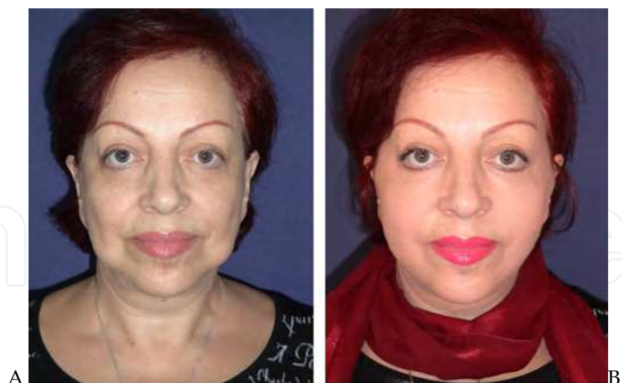
Fig. 8. A. Before, B. Result after cheek UAL. Change from square face into oval. The beauty triangle is achieved.

Optimally, patients should wear these 24 h/d for approximately 4 to 6 weeks (depending on summer or winter times and on flabbiness of the skin and tissue). In our geographic area compression will be advised for about a month in summer time, and for a month and a half in wintertime. It will reduce swelling and results will be visible more quickly.