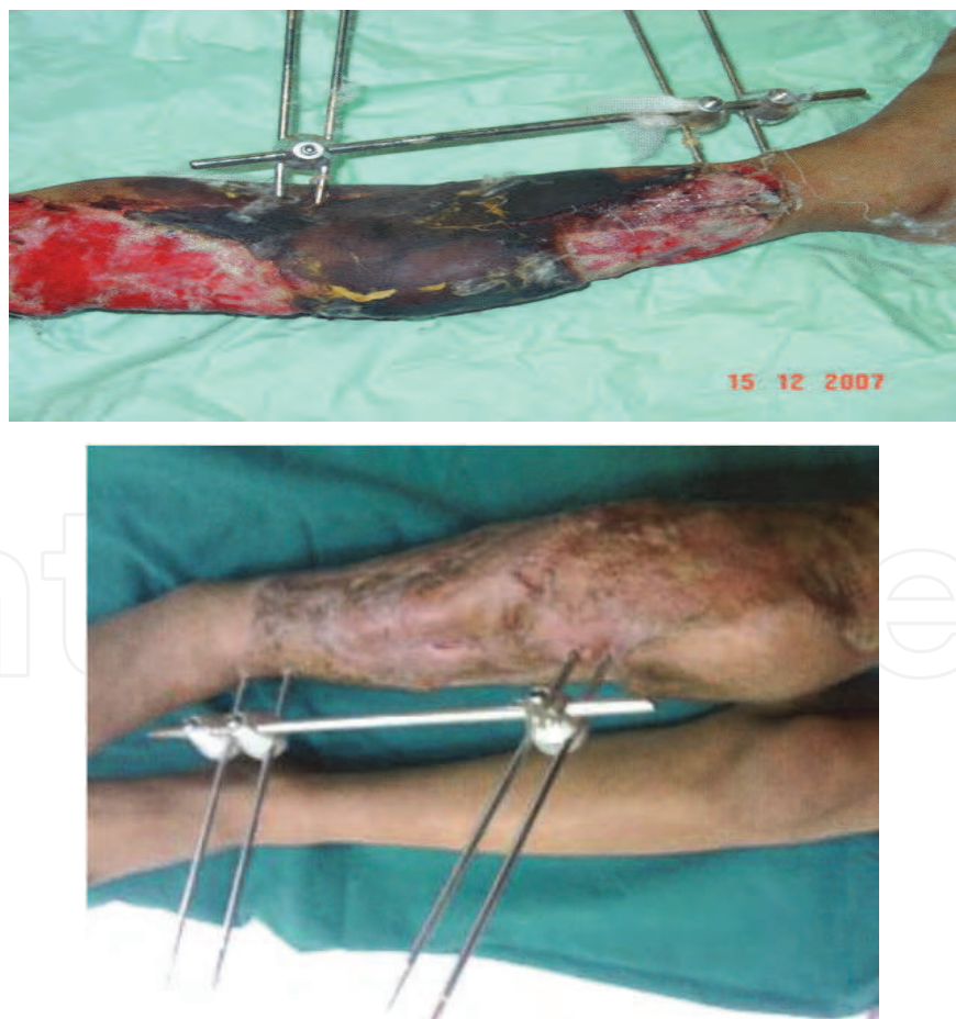
Fig. 4. Degloving injury of the right leg before and after debridement and reconstruction by STSG