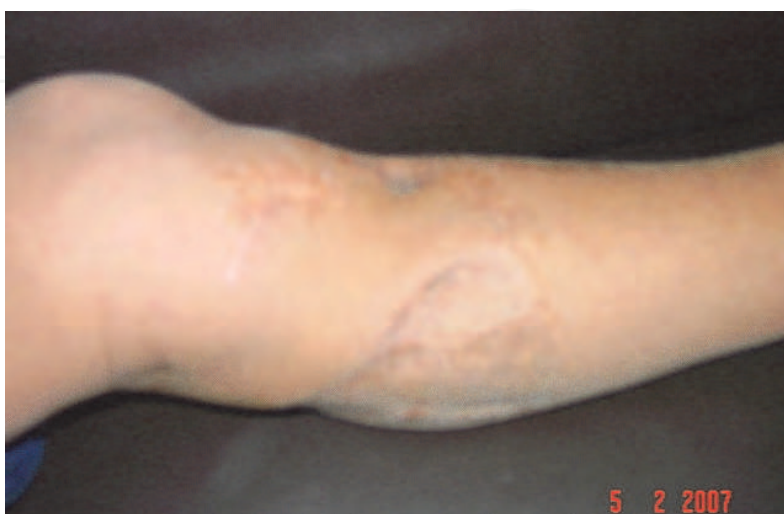
Fig. 8. B) the appearance of the graft after one year.