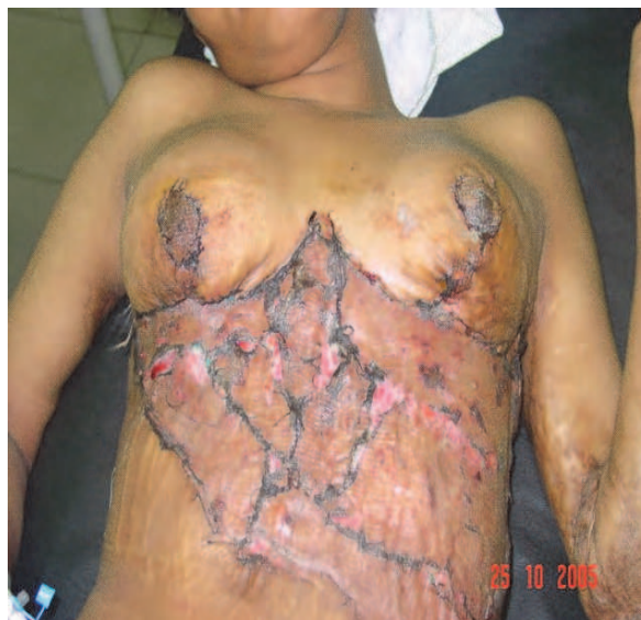
Fig. 5. B) After application of STSG to the row area of lower chest and upper abdominal wall