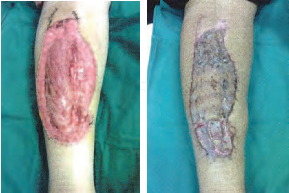
Fig. 3. Degloving injury of the right leg after debridement and after reconstruction by STSG