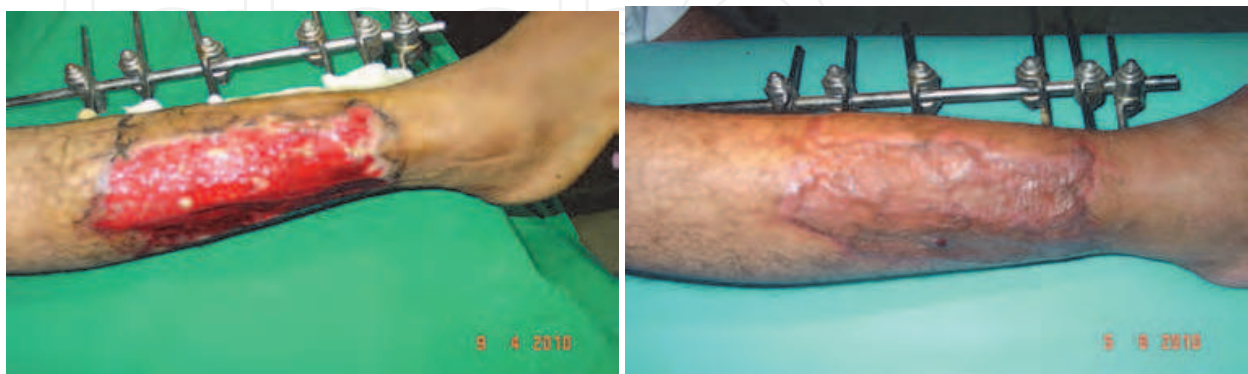
Fig. 2. Friction burns of the lateral aspect of the lower leg with full thickness skin loss and after reconstruction with STSG.

Friction burns ((fig. 2) and degloving injuries (fig. 3,4) due to car accident and other traumas which leads to full thickness skin loss are indication for split thickness graft. In cases of friction burns the area of skin loss should be washed thoroughly with sterile saline to make sure that the recipient site is clean and ready for grafting. If the wound still remains contaminated, it should be dressed until complete cleanliness of the wound is obtained.