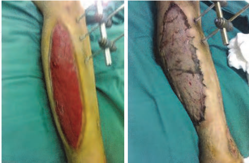
Fig. 9. Fasciotomy of the lateral aspect of the leg and after application of a STSG

Compartment syndrome of an extremity needs urgent release of the fascia (fasciotomy) to re-establish limb vasculature. The resultant fasciotomy wound usually requires reconstruction with a skin graft for closure after establishment of limb vasculature (fig. 9).