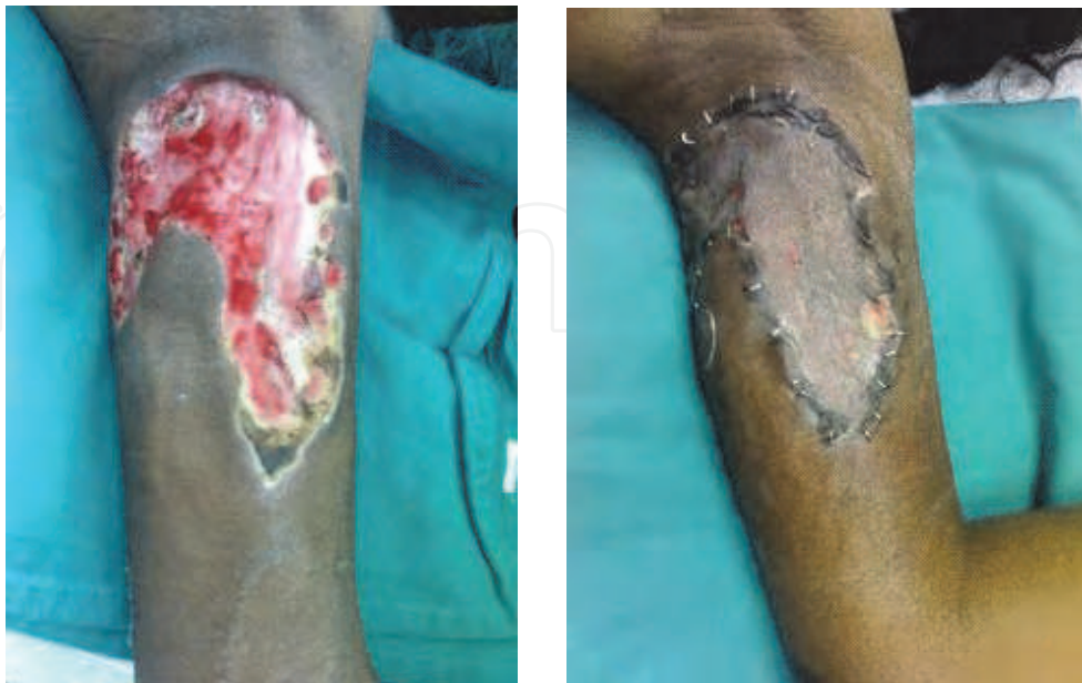
Fig. 10. Post necrotising fasciitis row area of the medial aspect of the arm and after debridement and application of STSG

Necrotizing fasciitis is considered one of the most common indications of skin graft after a thorough debridement of the dead tissue and clearance of the infection. Diabetic infections usually need extensive debridement and the wound closed with a skin graft (fig.10).