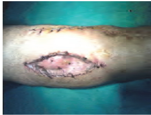
Fig. 7. Exposed tibia and after reconstruction by bipedicled flap and STSG applied to the donor site of the flap.