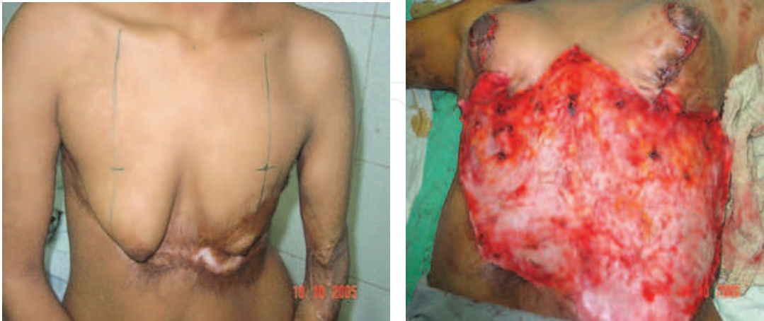
Fig. 5. A) Post burn breast contraction of both breasts and after release of breast contraction

After release of post burn contractures and after reconstruction by local flaps such as a transposition or bipedicle flap requires grafting to close the donor site (fig. 5-8). Also excision of large tumor usually need skin graft to reconstruct the resultant defect.