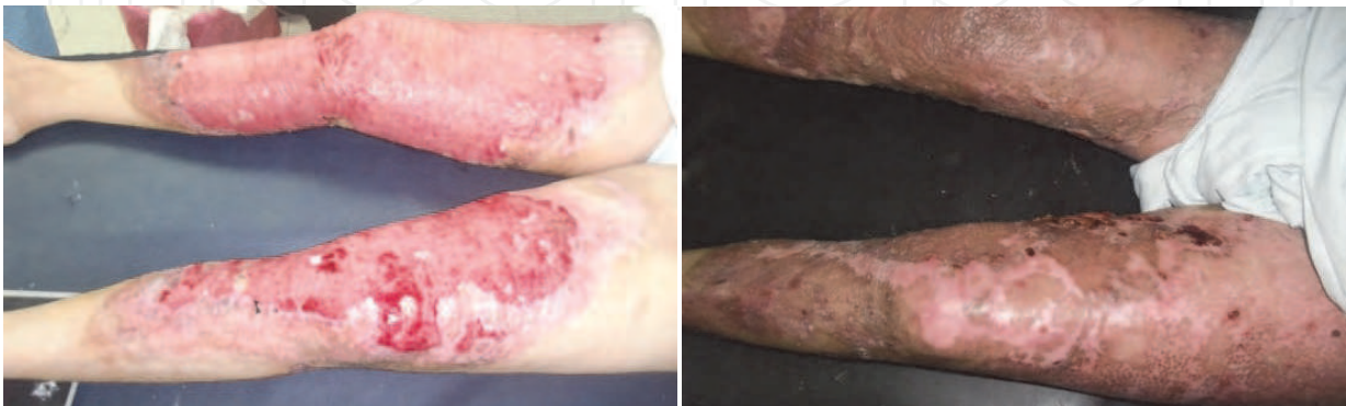
Fig. 1. Deep full thickness burns of both lower limbs and after reconstruction with STSG.

Deep full thickness burns destroy the skin and damage underlying tissues and are the most common indication For split thickness skin grafts (fig. 1) where, the skin is destroyed to its full depth, in addition to damage done to underlying tissues, and Deep full thickness burns must be covered as soon as possible to prevent infection and fluid loss. Wounds that are left to heal on their own (secondary intention) can contract and result in serious and painful scarring and actually prevent normal limb movement.