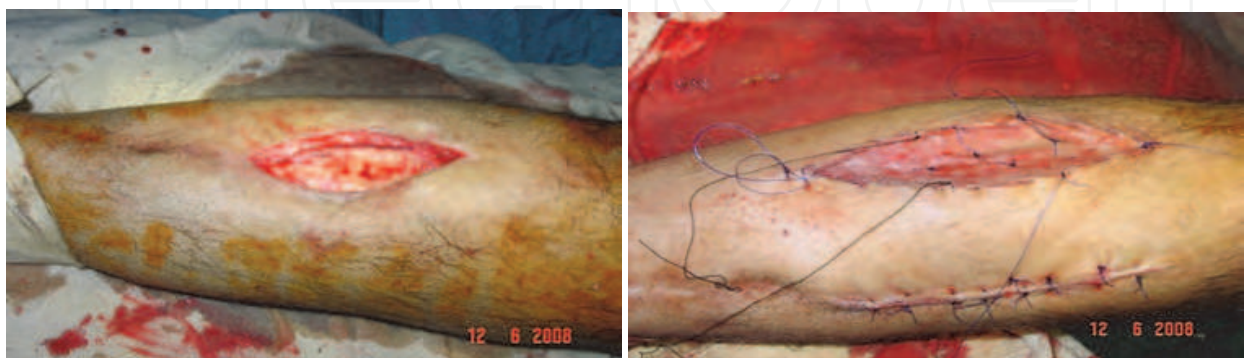
Fig. 6. Exposed tibia and after reconstruction by bipedicle flap and STSG applied to the donor site of flap