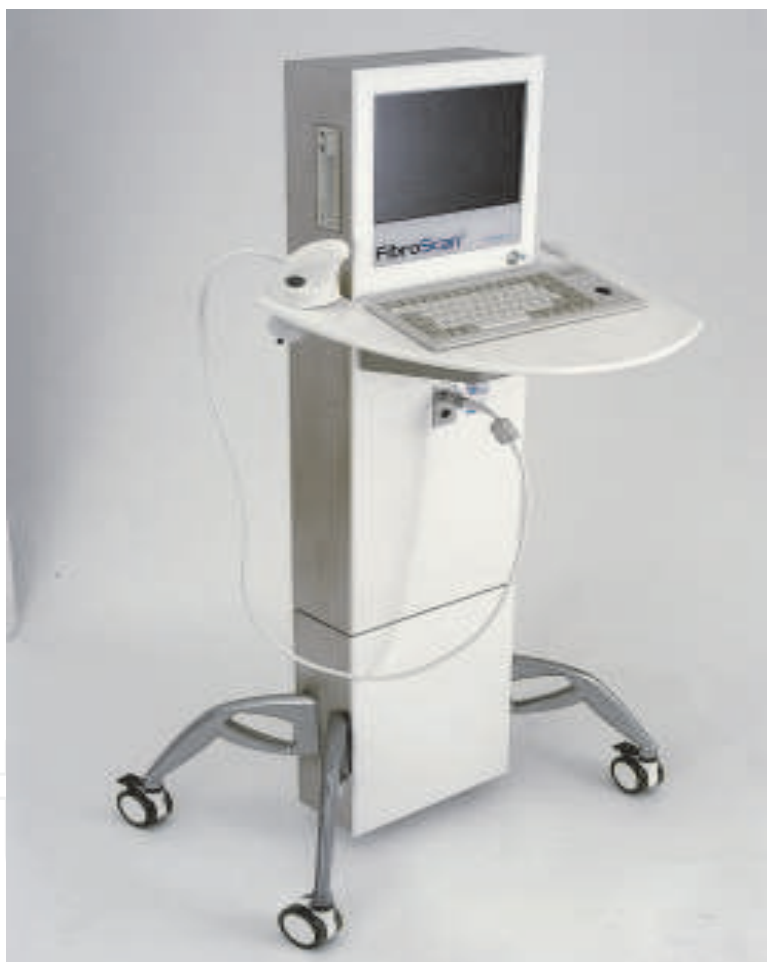
Fig. 4. Fibroscan.

probably is simpler than in CHB patients because in CHB not only the fibrosis is important but also the necroinflammation of the liver. Third, the AUROCs for F2 prediction in CHB which were reported in Asian studies found lower value than it found in Western studies. Beyond this point, study by Chan et al has showed there was a grey area in CHB patients with normal ALT between LSM 6.0-9.0 kPa, where a LSM 5.0-6.0 kPa would indicate insignificant fibrosis, a LSM >9.0 kPa had a high chance of bridging fibrosis, and that >12.0 kPa had a high chance of cirrhosis. It means in this grey zone the liver biopsy might be needed. (24,27,28) The use of TE in liver cirrhosis (LC) patients is still controversies since we have a lot of non-invasive parameters that can be used to diagnose LC. In some special conditions such as hemophilia, aplastic anemia, thrombocytopenia not related to liver disease, etc, TE might be a good consideration when those patients suffered from chronic active hepatitis virus infection (B & C).