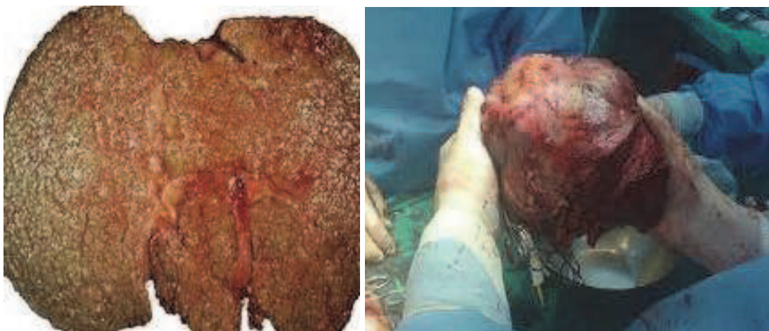
Fig. 3. Liver Cirrhosis and Hepatocellular Carcinoma Illustrations.

biopsy preparation but there is still lack of evidence. The only thing is that really matters are anticoagulant use and hemostase examination. Sampling error is that something that could happened because we only use small needle and probably we could only assess small area of the liver tissue even though we have the preconditions for liver tissue sampling so it can be assessed very well by the pathologist. However, until now liver biopsy is still a gold standard to obtain information about what happened in the progression of liver diseases and of course to see the improvement of liver histology after the patients received treatment. In Advanced liver disease, we have clinical (chronic liver disease stigmata such as icteric, spider nevi, hyper pigmentation, palmar erythema, splenomegaly, ascites, caput Medusa, and leg edema), biochemical parameters (low platelet count, albumin globulin ratio, hyperbilirubinemia, abnormal hemostase, etc), and imaging studies (ultrasound, CT-scan, MRI) to confirm the diagnosis so we don't have to perform any liver biopsy. (2,3,4,5)