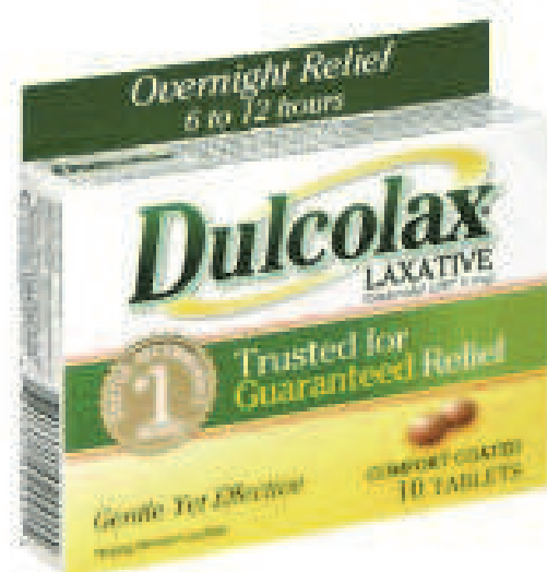
Fig. 6. Dulcolax tablets

Sodium picosulfate is another cathartic with osmotic action on the bowel similar to NaP. It is a saline laxative used in combination with magnesium citrate. An observational study done in Canada by Love and his colleagues found that administration of sodium picosulfate and magnesium citrate yielded a high percentage positive rate for efficacy (Yakut, M., Kubilay, Ç., Gülseren, S. et al., 2010). This preparation is mostly used in Europe and Canada and is not available in the United States (ASGE, 2009).