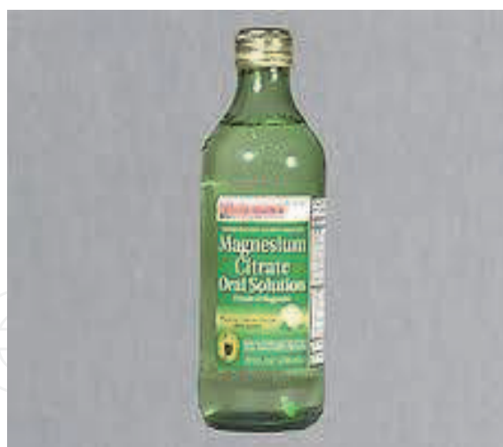
Fig. 5. Magnesium Citrate bottle

through the kidneys, administer with extreme caution in individuals with renal insufficiency or failure (Atreja, A., Nepal, S. & Lashner, B., 2010). Magnesium citrate is often used as an adjunct to bowel prep. In addition to the PEG solution, adding magnesium citrate to the prep reduces the amount of PEG solution required to 2L. Taken the night before the procedure (one 300 ml bottle of magnesium citrate) plus two bisacodyl tablets and 2L of PEG solution, has shown to be just as effective as taking the full dose of PEG solution. Used alone, magnesium citrate is not an effective bowel cleansing agent prior to colonoscopy procedures. Magnesium citrate is often used as an adjunct to bowel prep (Atreja, A., Nepal, S. & Lashner, B., 2010; Wexner, S., Beck, D., Baron, T., et al., 2006).