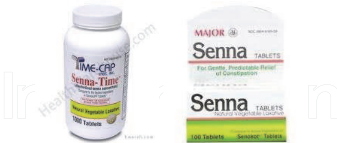
Fig. 8. Senna products