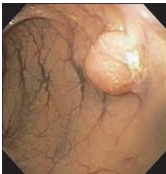
Fig. 1. Polyp in sigmoid colon

Colorectal cancer is the third leading cause of cancer-related mortality in the United States and the fourth most common cancer in men and women. Colonoscopy is the best screening test done to detect and prevent colorectal cancers. Abnormal growths such as a polyp, a tumor, or a suspicious-looking lesion in the colon or rectum can be biopsied or removed preventing the initiation of the carcinogenic process and potential metastases into other areas of the body, thereby, allowing patients to obtain a more effective treatment (s) with fewer side effects. Patients whose cancers are found early and treated in a timely manner are more likely to survive than those whose cancers are not found until symptoms appear (Atreja, A., Nepal, S. & Lashner, B., 2010; American Cancer Society [ACS], n.d, 2005). Figure 1 shows a picture of a polyp. Figure 1.a shows a picture of a cancerous tumor of the colon.