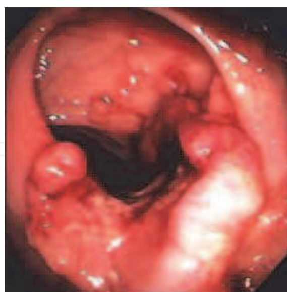
Fig. 1.a Cancerous tumor in the colon

The hardest part of the colonoscopy procedure is the preparation. It usually starts one-to-two weeks prior to the test depending on the recommendation of the physician. Careful planning and strict adherence to these instructions is crucial to the success of the test. Many individuals who have undergone this procedure will attest to the difficulty in complying