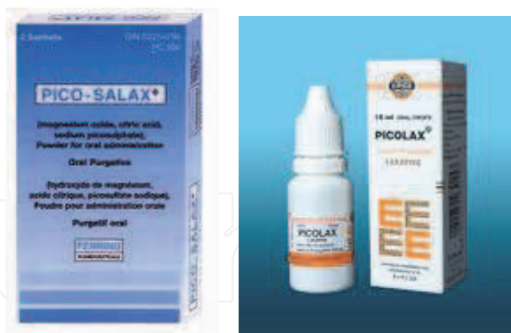
Fig. 7. Sodium picosulfate products. Not available in the US

Sodium picosulfate is another cathartic with osmotic action on the bowel similar to NaP. It is a saline laxative used in combination with magnesium citrate. An observational study done in Canada by Love and his colleagues found that administration of sodium picosulfate and magnesium citrate yielded a high percentage positive rate for efficacy (Yakut, M., Kubilay, Ç., Gülseren, S. et al., 2010). This preparation is mostly used in Europe and Canada and is not available in the United States (ASGE, 2009).