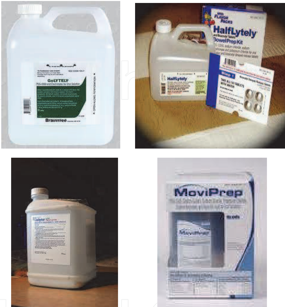
Fig. 3. Several commercially prepared polyethylene glycol solutions: Top left, GoLYTELY; top right, HalfLYTELY. Bottom left, Colyte and bottom right, MoviPrep.