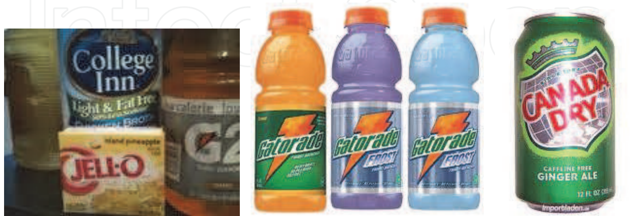
Fig. 9. Varieties of clear liquid: broth, Jello, apple juice or white grape juice, Gatorade, and ginger ale