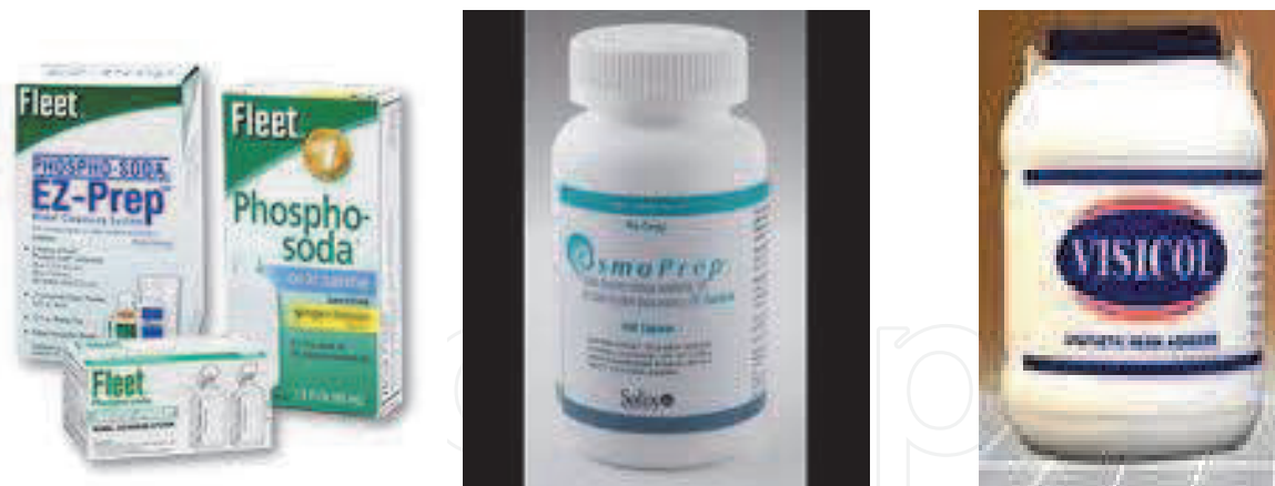
Fig. 4. Sodium phosphate products available in the US: OsmoPrep and Visicol. The aqueous formula is available only as a prescription.

through the kidneys, administer with extreme caution in individuals with renal insufficiency or failure (Atreja, A., Nepal, S. & Lashner, B., 2010). Magnesium citrate is often used as an adjunct to bowel prep. In addition to the PEG solution, adding magnesium citrate to the prep reduces the amount of PEG solution required to 2L. Taken the night before the procedure (one 300 ml bottle of magnesium citrate) plus two bisacodyl tablets and 2L of PEG solution, has shown to be just as effective as taking the full dose of PEG solution. Used alone, magnesium citrate is not an effective bowel cleansing agent prior to colonoscopy procedures. Magnesium citrate is often used as an adjunct to bowel prep (Atreja, A., Nepal, S. & Lashner, B., 2010; Wexner, S., Beck, D., Baron, T., et al., 2006).