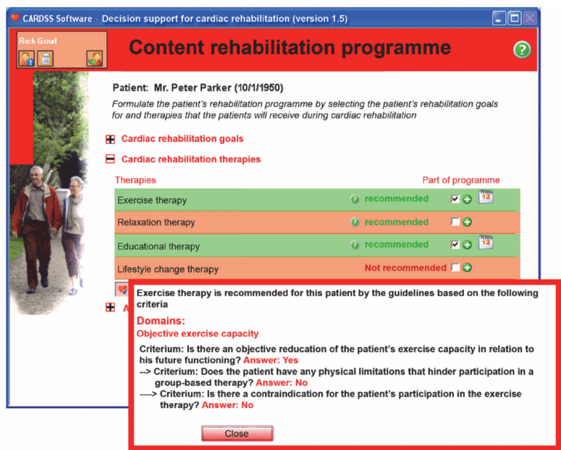
Fig. 2. Screen from the CARDSS system in which the rehabilitation programme is formulated based on therapy recommendations by the guidelines. The pop-up window displays the explanation why the system recommends giving exercise training for this particular patient.