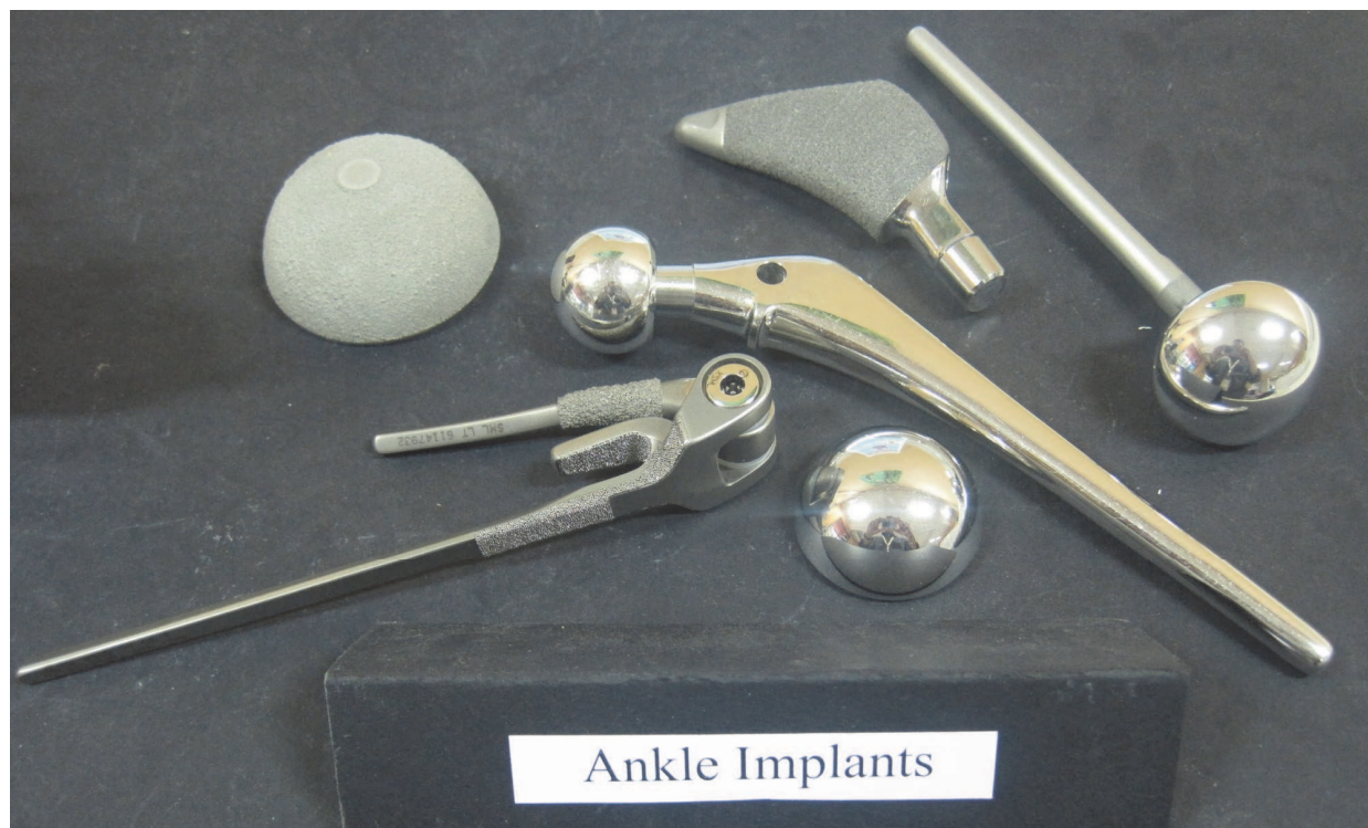
Fig. 1. A set of ankle implants.