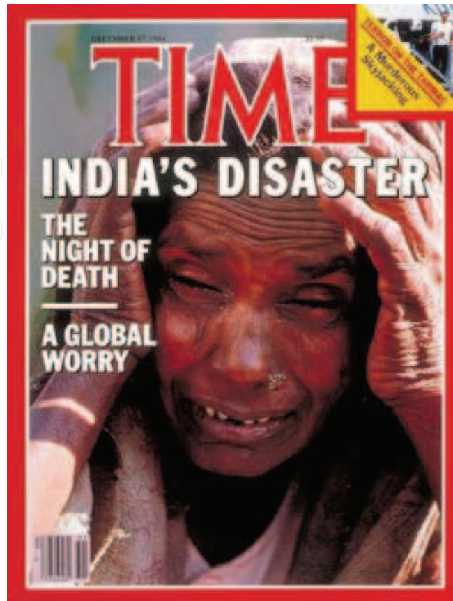
Fig. 1. Bhopal Disaster; cover in Time Magazine