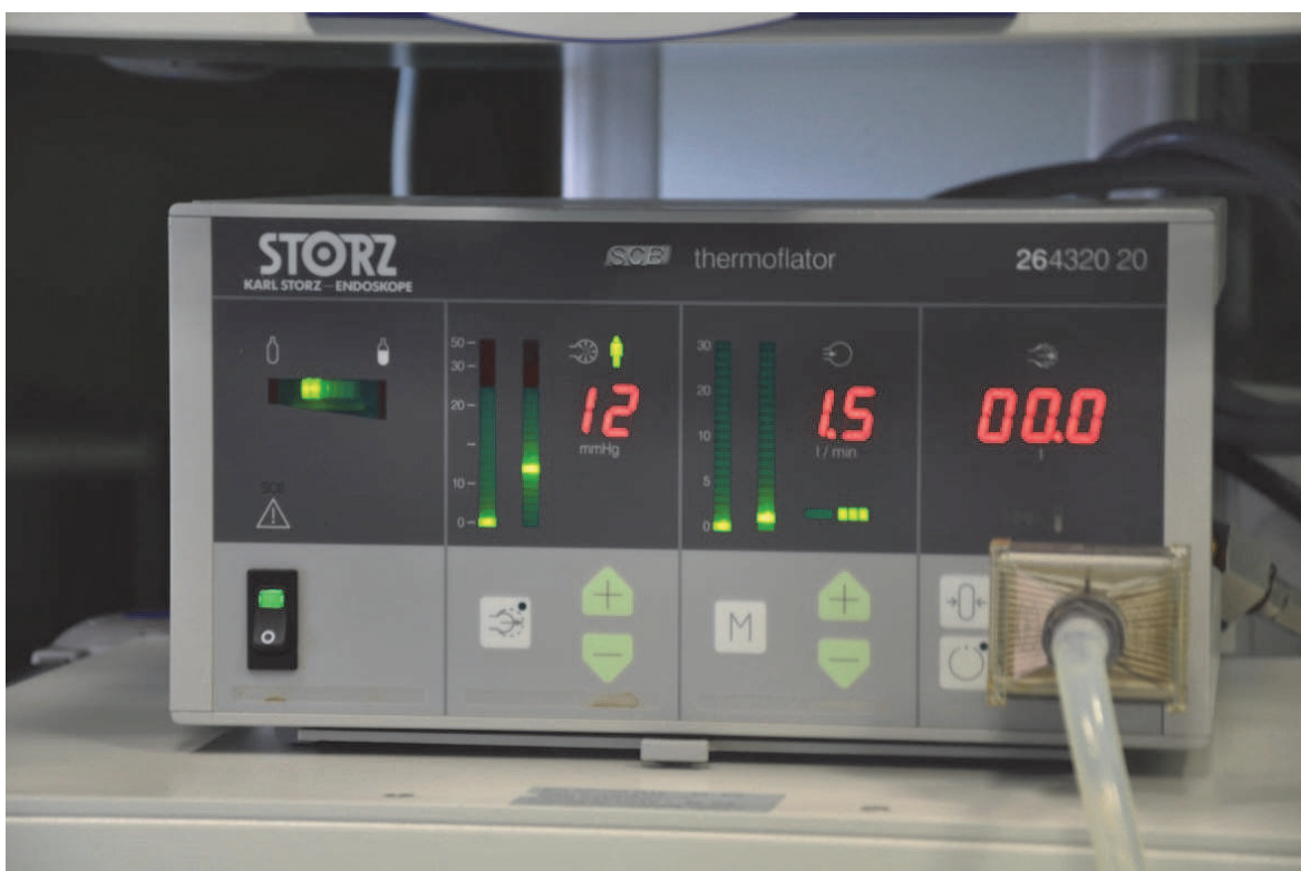
Fig. 1. CO 2 Insufflator showing normal working pressure.

The pneumoperitoneum increases the abdominal pressure, elevates the diaphragm and can compress both small and big blood vessels. The intra-abdominal pressure obtained during these procedures, which is usually 12mmHg (Fig. 1), increases central venous pressure (CVP), heart rate (HR), systemic vascular resistances (SVR) up to a 65%, and the pulmonary vascular resistances can rise up to a 90%. Cardiac output (CO) can increase on a healthy patient in Trendelemburg position, but can also decrease to a 50% on patients in anti-Trendelemburg position or with a low cardiovascular reserve. All those changes are usually well tolerated in healthy patients but it can be different in patients with systemic diseases.