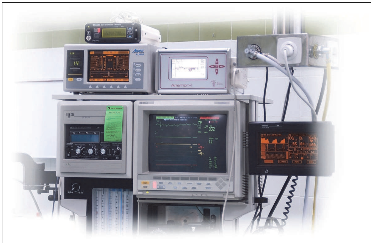
Fig. 2. Anesthetic monitoring during laparoscopic surgery.

Subcutaneous emphysema is always a laparoscopy associated risk. That makes mandatory to examine the patient for emphysema at the cervical, thorax and abdomen areas after surgery. It's also recommended to perform thorax radiography to rule out possible pneumothorax or pneumomediastinum complications.