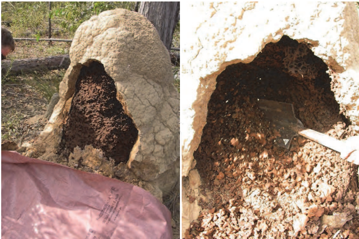
Fig. 2. Coptotermes acinaciformis mound displaying outer structure (7cm thick of 50% soil and 50% organic matter) with internal structure of ventilation space 1.5 cm and moist nest material with live termites.

We have described the network of short dead-end tunnels found in the irregular sponge-like outer walls of C. lacteus mounds that serve to 'trap' excessive moisture from within the mound, and so avoid moisture dripping down into the core of the mound. Furthermore, we hypothesize that this mound architecture allows rapid access to moisture for the colony members in times of prolonged drought and in order to carry out repairs and extensions to the mound. But, equally important, we suggest that this water source sustains their symbiotic micro-organisms (particularly actinobacteria) within the mound materials and within themselves (French & Ahmed 2010).