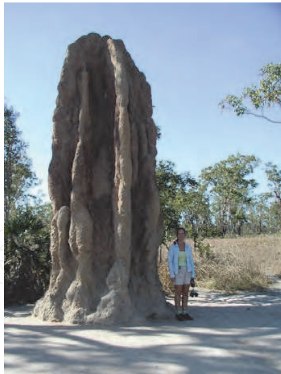
Fig. 3. Amitermes meridionalis (grass feeding) cathedral mound in Northern territory, Australia

Termites, together with their microbial symbionts, have a highly significant impact on biodegradation and biorecycling as well as shaping soil functions and properties in the tropics and subtropics (Bignell, 2006). The precise role of actinobacteria and other microbes in the life-cycle of a termite colony is still an area of research that is wide open for study (Kurtboke & French 2007).