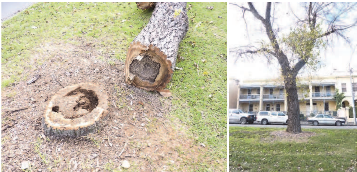
Fig. 4. Subterranean termite feeding is not random and balances the feeding territory within a living tree structure only attacking the dead cells (xylem cells) while keeping the sapwood living cells intact. Termites follow the Compartmentalization of Decay in Trees (CODIT) model perfectly. Of course, given time, the termites, just as the decay-causing microorganisms will breakdown all matter. But, in the early stages, the termites, just as the decay fungi in products, follow the CODIT model. And again, the termites will follow wound-altered wood that was preset in the living tree (see Shigo, 1979).

We recommend the further use of school children in garnishing scientific data on future termite surveys and hazard evaluations assisted by enthusiastic professional scientists. But again, this requires a total partnership approach, with industry, government and people engaging in an integrated pest management (IPM) approach to termite control based on sound ecological parameters and social priorities. These include adopting a mix of alternative strategies as mentioned above, plus planning to ensure continuous funding for termite Research & Development (R & D) and training and education programs to supply 'termite expertise' in the future.