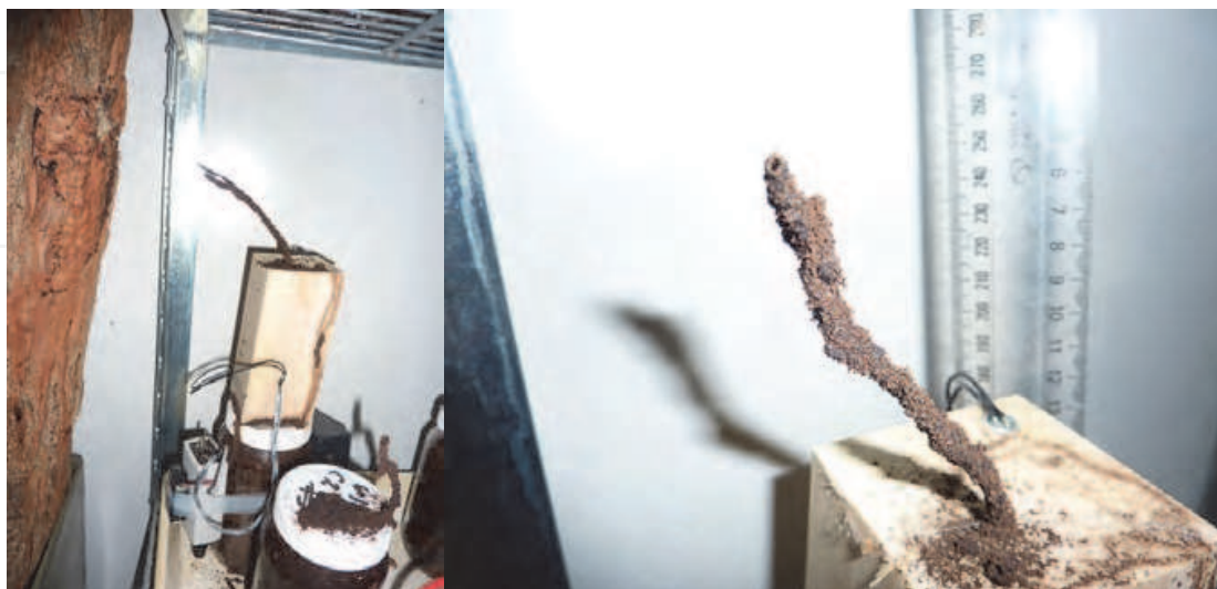
Fig. 1. Coptotermes termite constructing a bridge to reach food source in a laboratory set-up test Jars.

More recently, at an international conference at Arizona State University, USA, (18-20 February 2010), entitled 'Social biomimicry: Insect societies and human design', explored how the collective behaviour and nest architecture of social insects can inspire innovative and effective solutions to human design challenges (Figure 1).