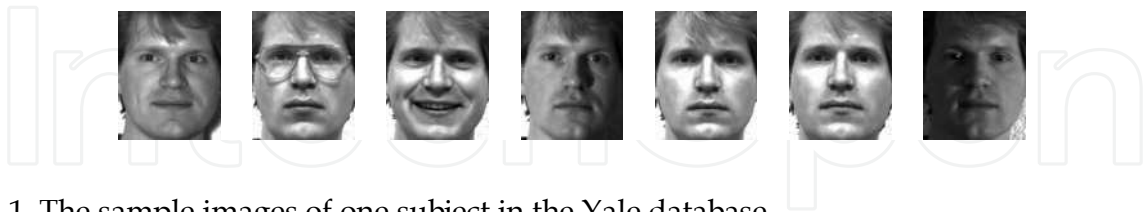
Fig. 1. The sample images of one subject in the Yale database

left-light, without glasses, normal, right-light, sad, sleepy, surprised, and wink. All sample images of one person from the Yale database are shown in Fig. 1. Each image was manually cropped and resized to 100 \times 80 pixels. In all experiments, the five image samples (centerlight, glasses, happy, leftlight, and noglasses) are used for training, and the six remaining images (normal, rightlight, sad, sleepy, surprise and wink) for test.