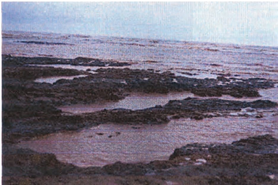
Plate 1. Wave breaking on a muddy coast at Aiyetoro, Nigeria

unstable, the continuous agitation of the surf zone by breaking waves transport mud material cross-shore and equilibrium conditions are hardly attained. Thus muddy coastlines hardly form breaches, which offer natural coastal protection systems. Plate 1 shows the action of breaking waves on a muddy coastline.