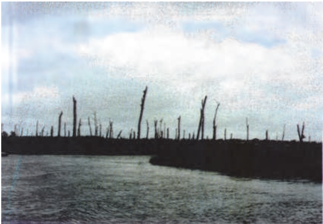
Plate 2. Dead vegetation around Awoye inlets