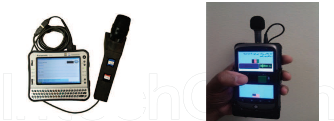
Fig. 2. BBN TransTalk Two-way S2S Translator on UMPC and Smartphone platform.

The foreign language speaker's reply ("Arabic" in Figure 1) is sent to the foreign language recognizer, which outputs text in the foreign language. The foreign language text is translated into English text with a process similar to the one in English-to-Foreign direction. The translated text is then sent to a second speech synthesizer, which speaks it out for the English speaker to hear, and/or displaying it on a screen.