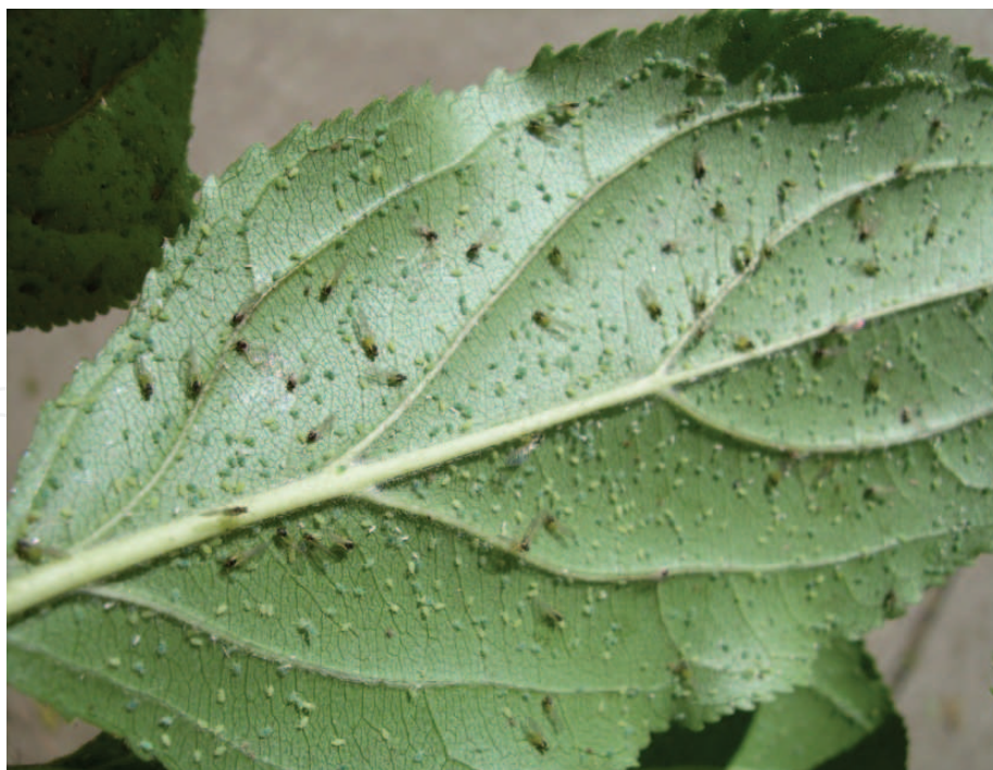
Fig. 2. Soybean aphids on buckthorn ( R. cathartica ). Note the presence of winged forms (most likely males (androparae) and females (gynoparae) and wingless females (oviparae). Picture taken on October 6, 2006 in Toledo, OH, USA.

The life cycle of the soybean aphid in North America is similar to what is known from its native range (Wang et al. 1994). It is a typical heteroecious, holocyclic species, alternating among sexual reproduction on primary hosts and asexual reproduction on secondary hosts (Ragsdale et al. 2004). The primary hosts are various buckthorn trees ( Rhamnus spp., Voegtlin et al. 2005; Yoo et al. 2005). Buckthorn is a widely distributed herbaceous shrub in the flowering plant family Rosales. This shrub is commonly used for horticultural and landscaping, especially along hedges and fence rows. These characteristics led to the introduction of buckthorn into North America from Europe by the early 19 th century. It quickly became invasive and led to an invasion meltdown involving 10 other Eurasian plant, animal and pathogen species (Hiempel et al. 2010). In North America, overwintering of the soybean aphid mainly occurs on Rhamnus cathartica (common buckthorn, Figure 3), but can also occur on R. alnifolia (alderleaf buckthorn), R. lanceolata (lanceleaf buckthorn) and F. alnus (glossy buckthorn) (Voegtlin et al. 2005; Yoo et al. 2005; Hill et al. 2010). Across its native Asian range, R. davurica and R. japonica are the main hosts (Yoo et al. 2005).