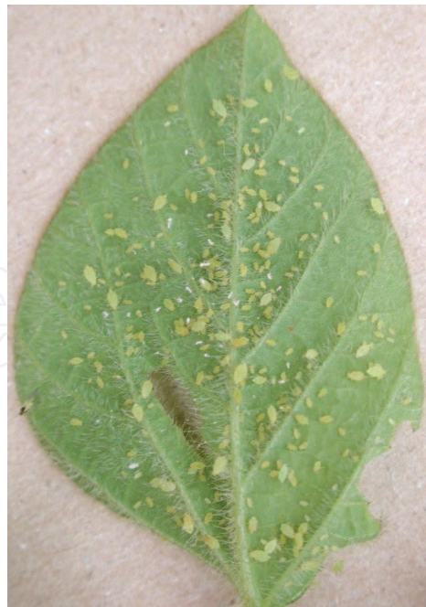
Fig. 1. Soybean aphid infestation on soybean

To fully understand the threat to host-plant resistance, research must focus not only on developing new varieties of soybean-aphid resistant soybean, but also on the genetic, genomic and evolutionary factors involved in adaptation and spread of soybean aphid biotypes. This chapter will review the current status of soybean aphid biotypes, highlight functional and population genetic and genomic studies that may provide clues to uncovering the basis for soybean aphid biotype adaptation, and outline future studies that will be necessary if resistant soybean varieties are to be used and preserved as a soybean aphid management strategy.