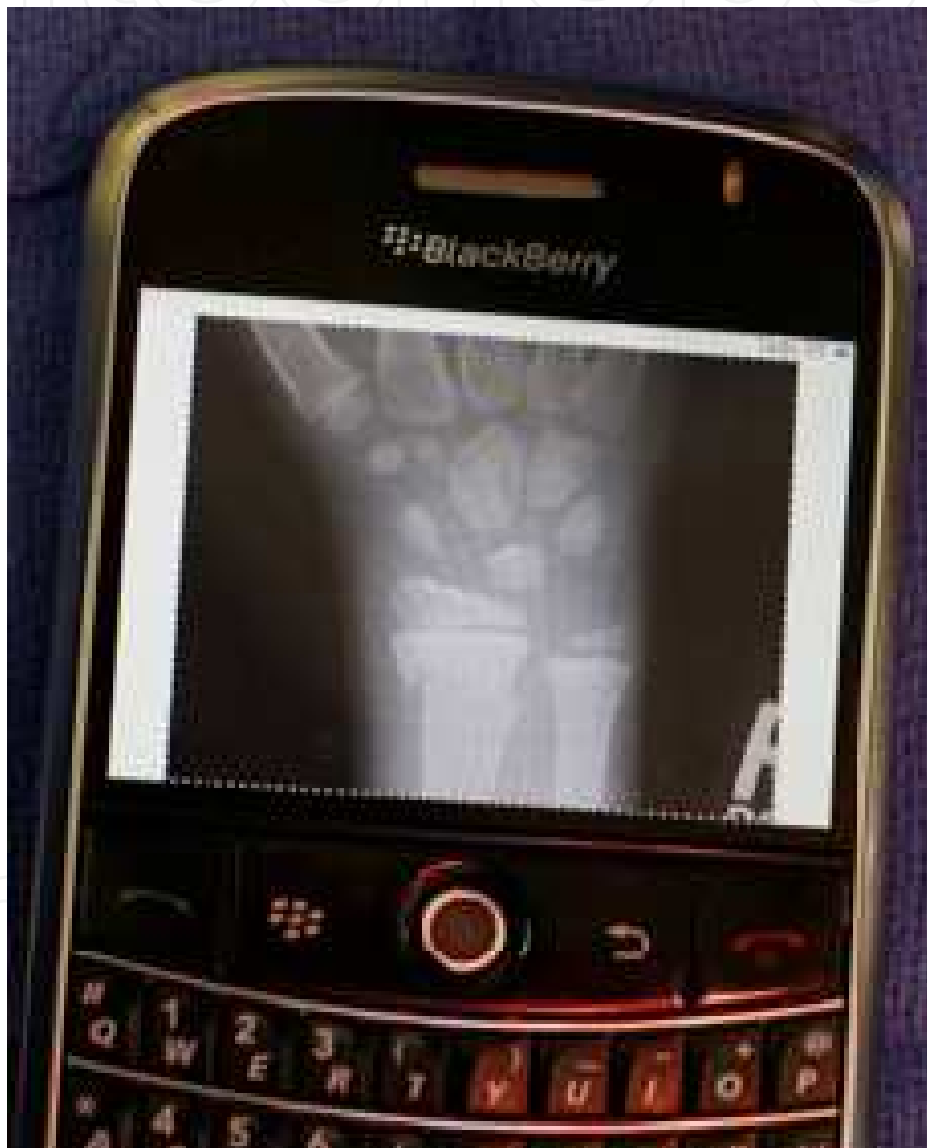
Fig. 3. Telemedicine in action: quick communication between the primary care physician office and surgical specialist streamlines decisions regarding how quickly the patient should be seen. In this case simple transmission of patient's x-ray facilitated his care: the patient who fell on outstretched hand the evening before was asked to come see a surgeon for reduction of his radial fracture on the same day he saw his primary care physician, and actually was scheduled for surgery prior to his arriving to the Plastic Surgery Clinic.

not alter the image in any way. However, the rate of image compression is relatively low, typically 2:1. Much better rates of compression can be achieved by using Lossy compression. Lossy compression systems discard some information from the image, usually by removing small differences in pixel color that, ideally, are inconsequential (e.g., plastic surgery documentation frequently uses Joint Photographic Expert Group, JPEG)(Jones SM et al, 2004). In plastic surgery applications it is important to test the image compressing ratios and determine the maximum compression of the image for speedy transfer that will retain the minimum image quality for accurate clinical decision-making from the recipient (Patricoski C et al, 2009).