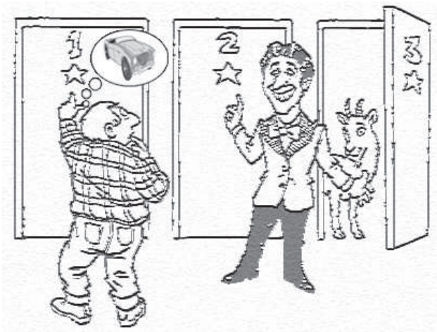
Fig. 2. The Monty Hall paradox first appeared in 1975 on the American television game show Let's Make a Deal , hosted by Mr. Monty Hall (1921 – present). The game show aired on NBC daytime from December 30, 1963, to December 27, 1968, followed by ABC daytime from December 30, 1968, to July 9, 1976, along with two primetime runs. It also aired in syndication from 1971 to 1977, from 1980 to 1981, from 1984 to 1986, and again on NBC briefly from 1990 to 1991. Historical records from Wikipedia ( http://en.wikipedia.org/wiki/Monty_Hall ) and special thanks to Tae Chun for the illustration.

Is it to your advantage to change your choice? It is better to stay with door #1 or is it better to switch to door #2 or is the probability of winning the same for either choice?