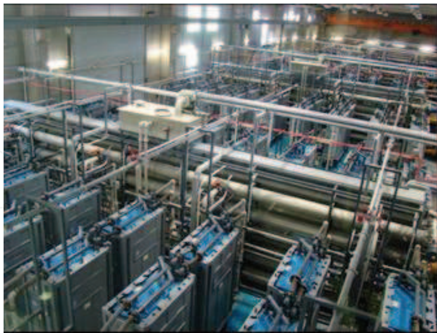
Fig. 3. Details of the EDR step at the Abrera DWTP.

produced through the EDR line. THMs's average values in the water product of the DWTP ranged between 40 and 60 \mu\text{g/L} . The energetic average consumption for the EDR process (stacks and pumps) has been lower than 0.6 kWh/ \text{m}^3 . During the indicated period the hydraulic performance has been higher than 90%, with a reduction of salts (measures like conductivity) higher than 80% in summer. Specifics consumptions of HCl were of 0.08 Kg HCl/ \text{m}^3 and for antiscalant in the rejection of brine 0,002 Kg/ \text{m}^3 (Valero et al., 2010)