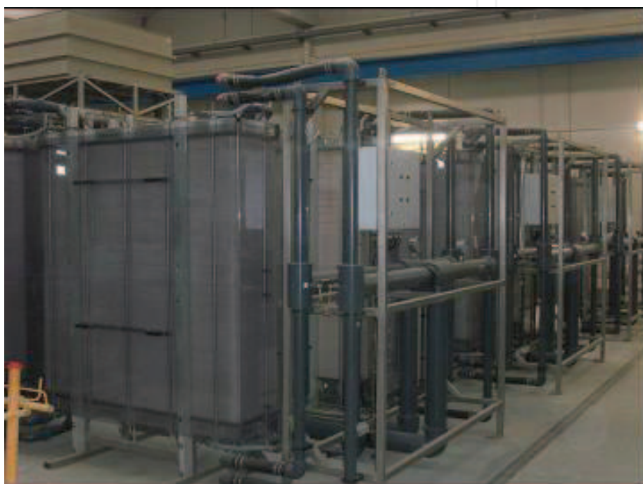
Fig. 4. EDR stacks at the Depurbaix WWTP.

The plant started operating on a trial basis in January 2010 and came into the normal operation from September 2010. The full automatic modular system allows the operation according to the expected use of the product water.