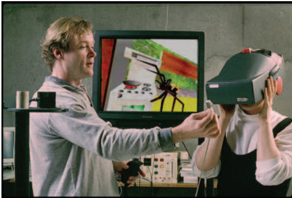
Fig. 4. VR-environment used for exposure treatment of arachnophobia