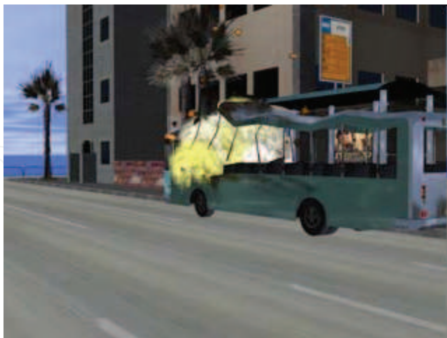
Fig. 5. „BusWorld“

Overall these study designs give rise to ethical concerns. Exposing Vietnam veterans suffering from severe PTSD symptoms to authentically recreated war scenarios or exposing witnesses of the 9/11 attacks to the same, dramatic virtual situation is a form of exposure that is contra-indicated as far as current research on trauma therapy is concerned. Several phases (i.a. stabilization, developing a therapeutic relationship, resolution of the traumatic memory, where the course of the traumatic situation is outlined and thus encapsulated) must precede re-experiencing and processing the traumatic experience (comp. Fischer, 2000; 2007). None of these phases were considered in the studies referred to here. Therefore, the risk of re-traumatization in VR exposure therapy is higher than the likelihood of successful processing of the traumatic experience. (For more critical issues, e.g. risk of renewed traumatization because the presented stimuli do not exactly depict the traumatic situation that the patient experienced, see Wagner & Maercker, 2009). At the same time, VR can be used to educate health professionals about recognizing symptoms by practicing adequate negotiation using a simulated case (see Kenny et al., 2008).