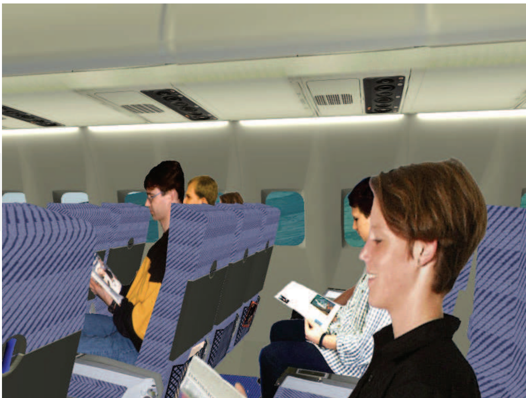
Fig. 2. VR-environment used to treat fear of flying

The therapeutic potential of VR exposure as part of behavior therapy to treat acrophobic patients was confirmed in a study series by Emmelkamp et al. (2001). In the first study, a within-subjects design was used. Ten acrophobic patients were gradually exposed to heights in VR during sessions and then went in-vivo to heights in the company of the therapist. The extent of their acrophobia was measured before treatment, after VR exposure, and after in-vivo exposure. Various scales indicated significant improvement after VR exposure, while only one variable (Fear of Heights, Cohen) registered additional improvement after in-vivo exposure. The authors assumed that a blanket effect had happened in the sense that VR treatment was so effective that no further significant improvement could be achieved after repeated in-vivo exposures. In a second study (Emmelkamp et al., 2002), VR and in-vivo exposure were compared in a between-subject design. N=33 acrophobic patients with an average age of 44 ( SD=9.3 ) and having suffered from the disorder for an average of 31.5 years ( SD=11.3 ) were randomly exposed to both VR and real settings. Each exposure was