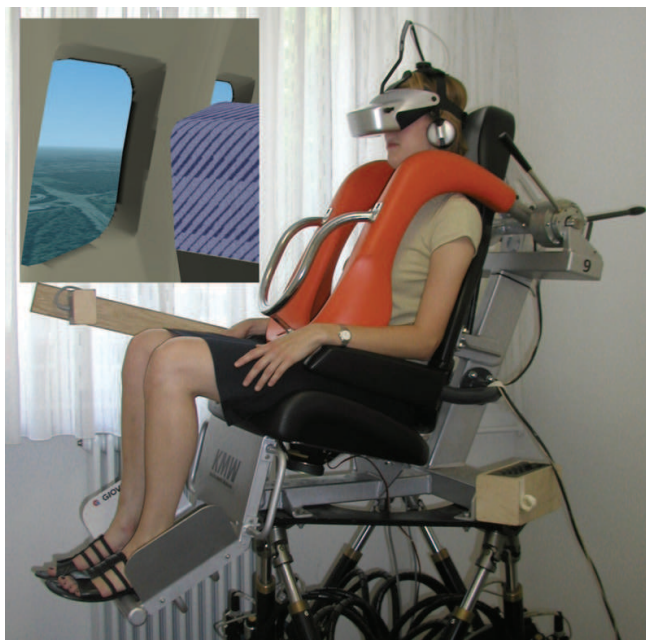
Fig. 3. Fear of flying: simulator

treatment environments, because an actual flight was not part of the therapy. A further study conducted by Wiederhold et al. (2003) revealed that graduated VR treatment combined with the feedback of physiological parameters (breathing, heart frequency, skin resistance) was most effective in comparison to pure VR therapy and imaginal exposure using the same graduated exposure to fear. In a randomized study, the authors found that 20% of the patients in the imaginal environment, 80% of the patients in the VR treatment and 100% of the patients who received VR exposure with additional feedback of biological parameters were able to fly again after eight weeks of therapy. Study series by German scientists from the University of Würzburg also substantiated the effectiveness of VR: Even short-term VR exposure therapy in only one session is useful for treating fear of flying in the long run. The authors demonstrated the participation in a completion flight is important for long-term therapy success, while the attendance of a therapist during this flight has little influence (Mühlberger et al., 2006). The following pictures show the simulator as well as a section of the VR (inside of the airplane) the way they were used in the Würzburg studies.