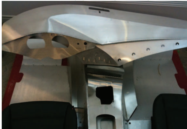
Fig. 2. Folded Instrument Panel

The new joining line will receive bigger sub-assemblies that can be joined directly to the vehicle under-body; this due to the fact that the cells that used to provide the welding line with the different assembled parts such as; floor assembly, rear-floor assembly, engine compartment, roof cowl, are all shifted to be done in the stamping step. Also, joining certain reinforcements can also be done in the stamping process by using the techniques of In-Die joining. So, a shorter body-weld line is achieved.