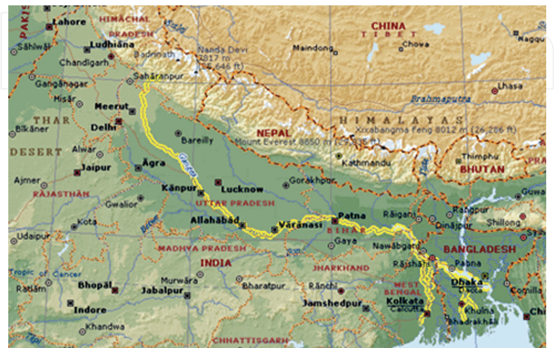
Fig. 1. Course of the River Ganga showing different stretches ( http://www.gits4u.com/water/ganga1.gif )

Labeo rohita and Cirrhinus mrigala and their spawning occurs during the monsoon (June-July) and extend till September. In recent years the phenomenon of IMC maturing and spawning as early as March is observed, making it possible to breed them twice a year. Thus, there is an extended breeding activity as compared to a couple of decades ago (Dey et al., 2007), which appears to be a positive impact of the climate change regime.