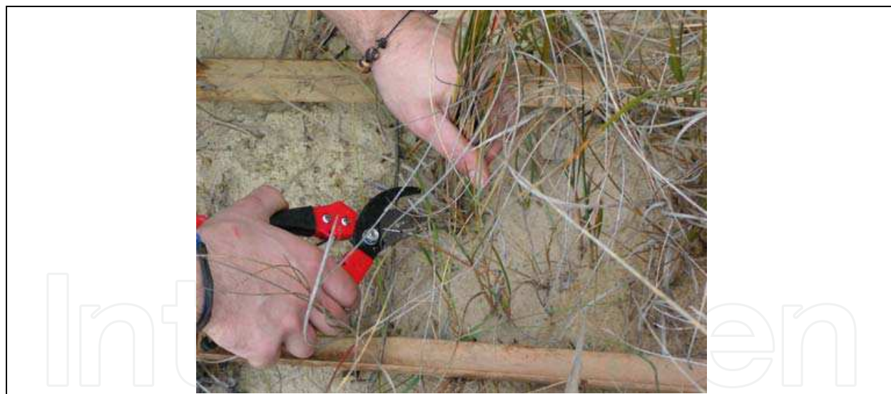
Fig. 2. Sampling Spartina versicolor above-ground biomass along a transect in a representative tussock. Each transect was a belt of contiguous quadrants (10 cm radially \times 15 cm wide) across the radius of a tussock; every quadrant sampled a concentric ring around the tussock centre so that the results integrated the zones of different density within the clone.

Temporal changes in subterranean biomass of cordgrasses are not well established. However, Spartina below-ground biomass does not seem to show as clear a temporal pattern as the aerial biomass does, with higher accumulations at the end of the warmer season (Darby & Turner, 2008b).