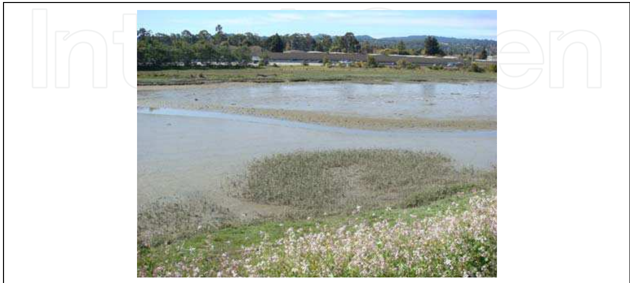
Fig. 5. Clump of the hybrid of Spartina foliosa x alterniflora colonizing a mudflat, where the native Spartina foliosa is not able to survive, in San Francisco Bay (California).

(Castellanos et al., 1994; Castillo et al., 2000; Proffitt et al., 2005). Thus, sediment deposition develops with the establishment of these foundation cordgrasses at low marshes, which yields abiotic environmental changes such as decreasing anoxia and flooding period (Castellanos et al., 1994; Craft et al., 2003; Bouma et al., 2005; Castillo et al., 2008a; Castillo et al., 2008b).