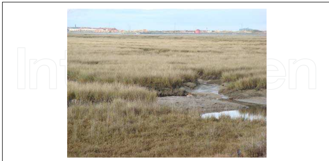
Fig. 6. Salt marsh invaded by the South American neophyte Spartina densiflora in Humboldt Bay, California.

Future research is needed specially to improve our knowledge about cordgrass below-ground biomass accumulation, dynamic and functions. The evaluation of the salt marsh ecosystem will be incomplete if based exclusively on what is happening aboveground, or as though what happens aboveground is a satisfactory indicator of what is driving changes belowground. Monitoring programs, for example, could be improved if belowground soil processes were included, rather than excluded, as happens frequently. Furthermore, it may be that because of the dominance of the changes in biomass pools belowground compared to aboveground, what happens belowground may be more influential to the long-term maintenance of the salt marsh than are changes in the aboveground components.