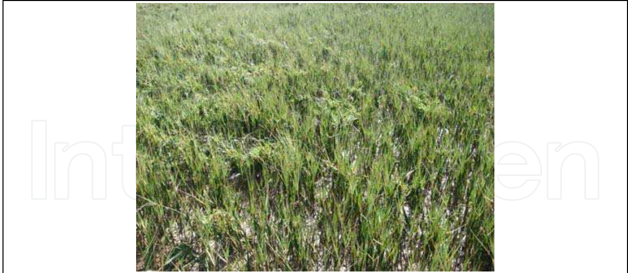
Fig. 4. Spartina maritima prairie, a cordgrass with “guerilla” growth from, starting to be outcompeted by Sarcocornia perennis subspecies perennis in Odiel Marshes (Southwest Iberian Peninsula).