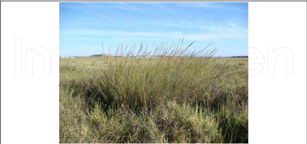
Fig. 3. Clump of the hybrid Spartina densiflora x maritima surrounded by S. densiflora and Sarcocornia fruticosa in Guadiana Marshes (Southwest Iberian Peninsula).