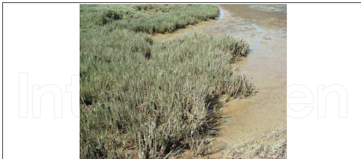
Fig. 1. Small cordgrass ( Spartina maritima ) grows on intertidal mudflats in European salt marshes where it forms continuous prairies with its coalescent clumps that colonize bare sediments with long rhizomes.