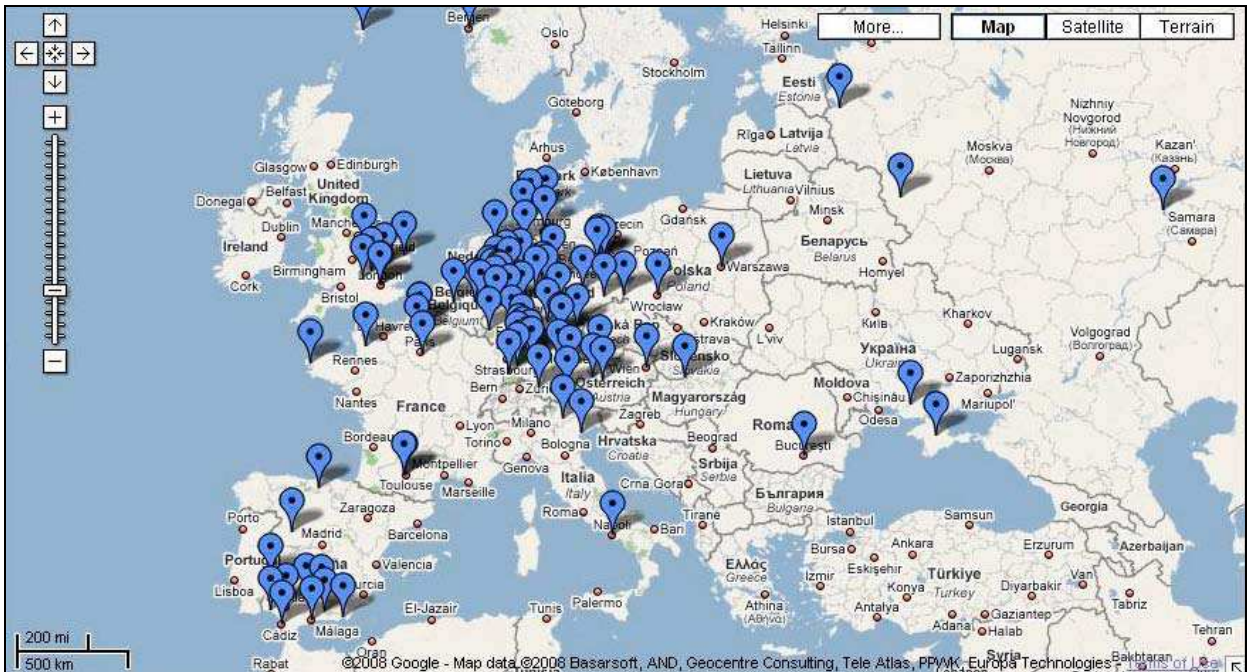
Fig. 2. RegioWikis in Europe (as of 2008)

By now there is a multiplicity of wikis and blogs with a clear link to a locality. This has even been the occasion for the formation of the European RegioWiki Society ( http://regiowiki.eu/Community_portal ) to represent their interests at European level. Figure 2 gives an overview of this.