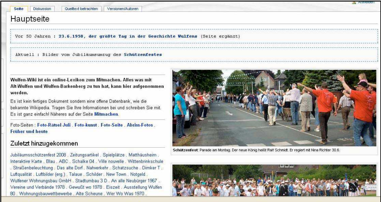
Fig. 1. Preserving customs in a CityWiki (here: shooting match Parade)