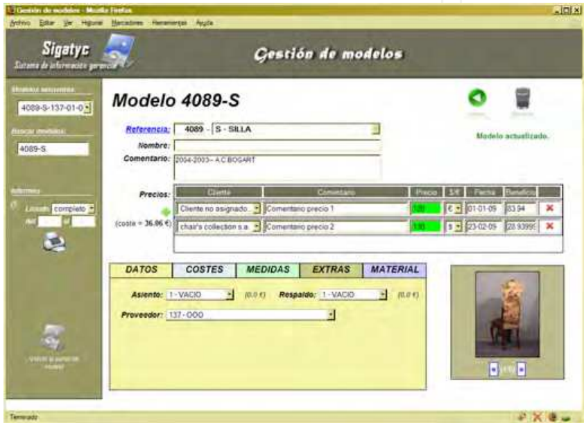
Fig. 2. Model management application with an image gallery web widget

Although the applications are grouped in five different groups, the access rights are granted by application, not by group. In this way, the end-users have a better delimited set of applications they can use. About existing applications, a remark should be made about “Customers and suppliers” ones. Extended ERPs are characterized for including two well known extensions called Supply Chain Management (SCM) and Customer Relation Management (CRM). These two extensions enable effective third-party business relationships between the organization, suppliers and the customers (Hossain et al., 2002). Despite the possible benefits both can imply, SIGATYC doesn't include these kinds of applications because of direct company decision. About the accounting application, this wasn't developed because the company already had a specific independent software package focused on this area. What the student did after the FDP evaluation, was to connect the ERP developed with the data files of the accounting application, allowing the reports applications to access and read the finance data, and connecting both software packages where necessary. This was an important part of the project because the CC company didn't want to lose the money investment made in the accounting application.